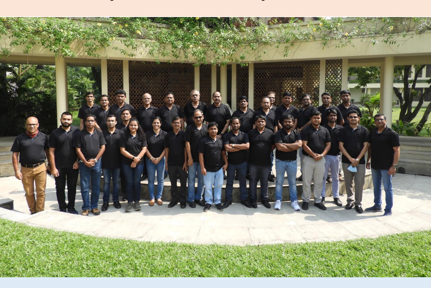
The IT Meet 2021 was organised from 21st to 23rd October 2021 at Vedic Village, Kolkata.