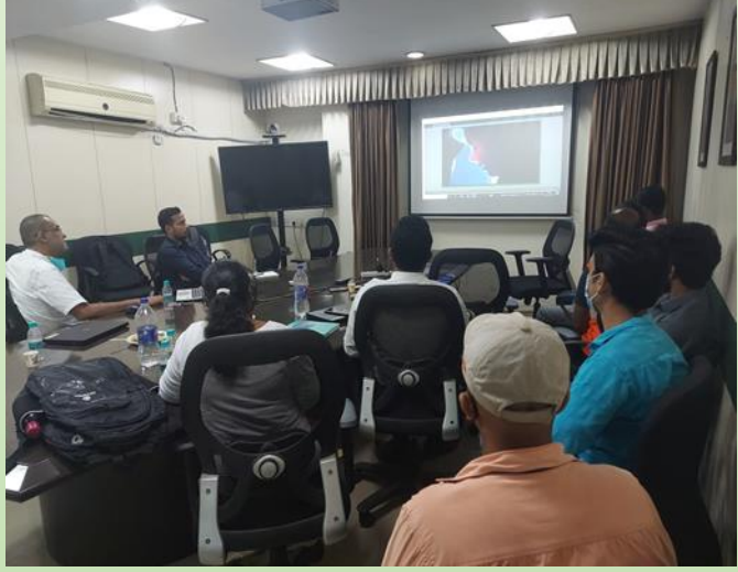
A training program on 'Electrical Safety' was conducted at Container Freight Station, Kolkata by the HSE Department on 5^{\text{th}} October, 2021.