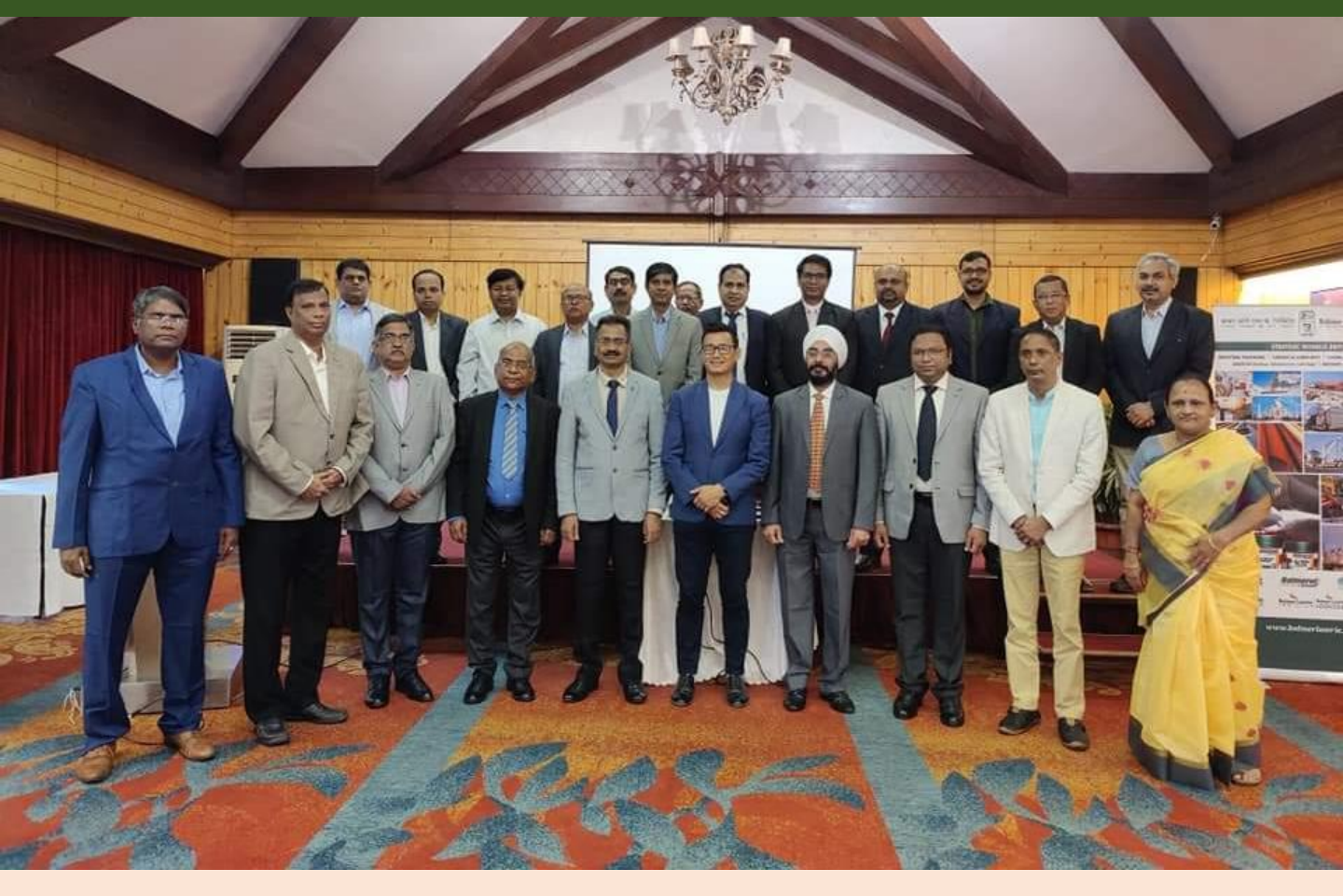
The Industrial Packaging (IP) Meet was organised in Gangtok on 7^{th} October 2021. Sikkimese sniper, famous footballer Baichung Bhutia addressed the IP team during the meet.