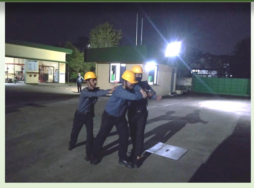
A 'Fire Mock drill' was organised during night time at Industrial Packaging, Taloja.