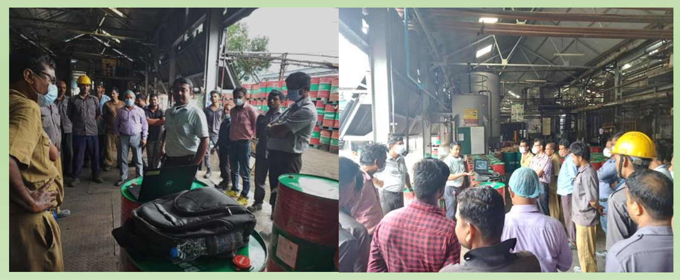
On 7^{th} October, 2021 a shop floor safety training on 'Confined Space' was conducted at Greases & Lubricants, Kolkata by the HSE Department.