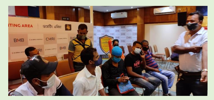
A COVID-19 vaccination camp was organised on 25^{\text{th}} July 2021 for contract labourers of G&L and CFS, Kolkata.