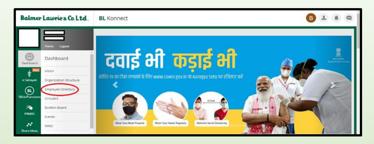
STEP-1: In the Home page of 'blintranet'; choose Employee Directory

The HSE Department has initiated a new search facility in the Employee Directory hosted in the intranet. Now, all BL employees can view the Blood Group of employees and contact them during any emergency situation. The process to access the details are as follows: