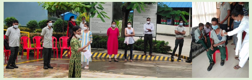
A COVID-19 vaccination drive was conducted in the factory premises of G&L - Silvassa on 23<sup>rd</sup> & 24<sup>th</sup> July 2021 wherein 68 workmen were vaccinated. An awareness program was also organised on 23<sup>rd</sup> July for maintaining continuous COVID-19 health related protocols as per the directives issued by the Government of India.