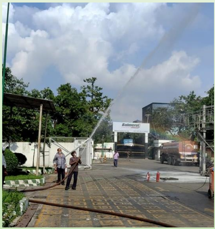
On 26<sup>th</sup> June 2021, a fire fighting mock drill was conducted at G&L – Kolkata.