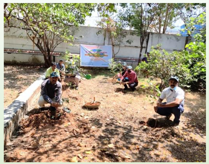
Manali complex, Chennai