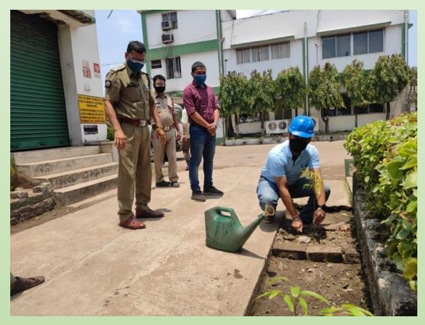
CFS - Kolkata