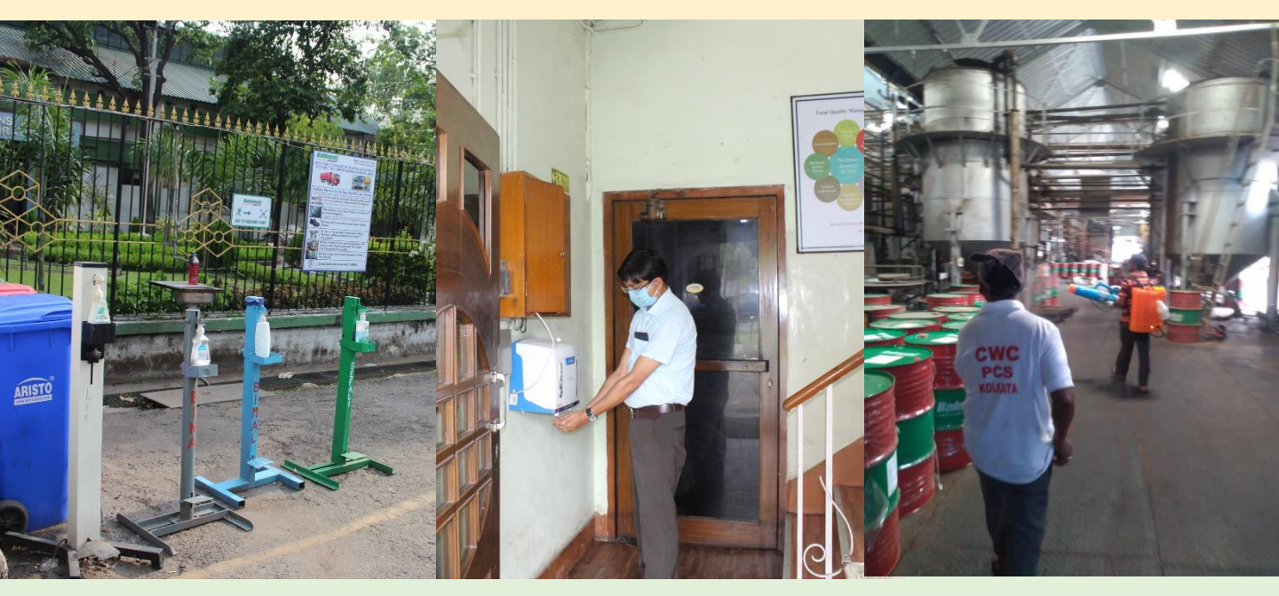
In early June 2021, Greases & Lubricants - Kolkata undertook initiatives as precautionary measures at the work place to prevent the spread of COVID-19..

In an endeavour to contain the spread of Covid-19, Balmer Lawrie organised vaccination camps for its employees and their dependents across all regions. The Company organized a two-day vaccination camp on 11<sup>th</sup> and 16<sup>th</sup> June 2021 in association with CMRI Hospital at its Corporate Office in Kolkata. A total of 337 persons were inoculated. As part of the drive organised on 10<sup>th</sup> June 2021 in the Mumbai region, 100 employees and their dependents were vaccinated at Cama and Albless Hospital, Mumbai and MGM Hospital, Navi Mumbai. 73 and 76 employees were inoculated in the Northern and Southern regions respectively. The camp in New Delhi was organised on 5<sup>th</sup> June 2021.