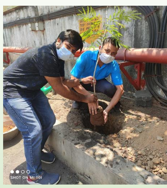
CFS - Chennai