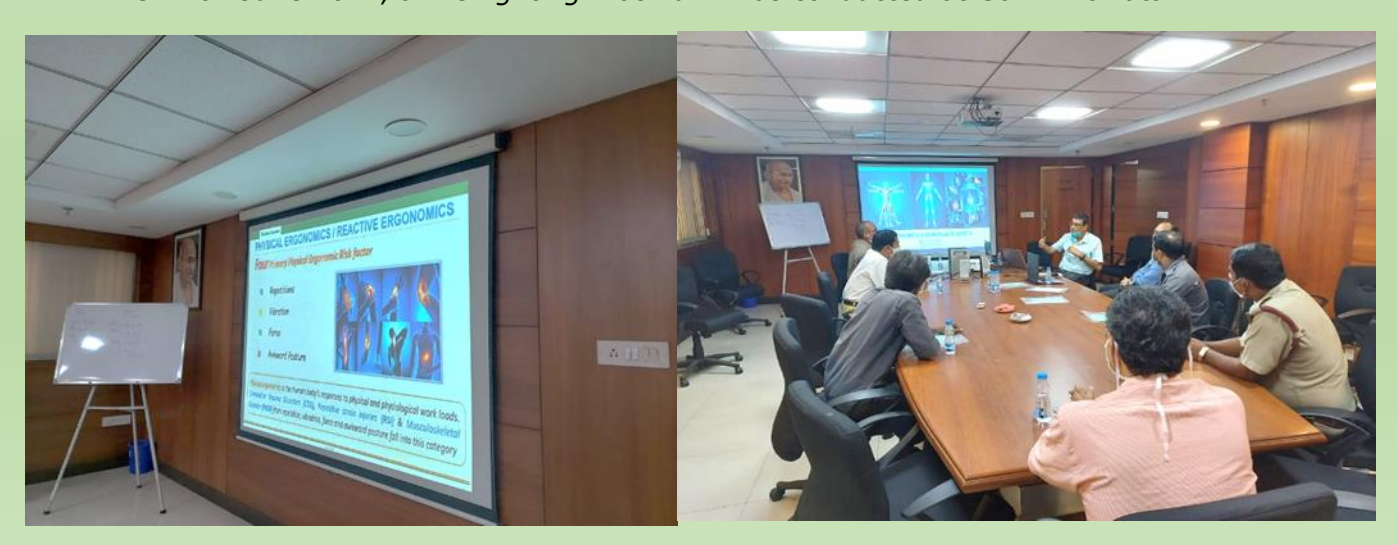
A Safety Training session on 'Ergonomics in Workplace" was conducted at G&L - Kolkata on 25<sup>th</sup> June 2021.