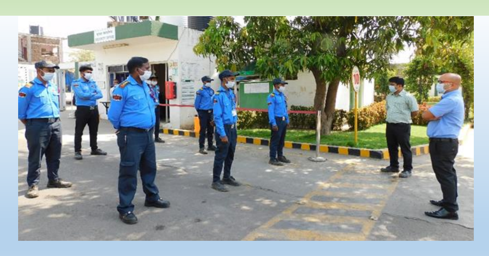
G&L, Silvassa organises fortnightly training for security guards every Monday.

To contain the spread of COVID-19 pandemic, units / establishments of the Company are regularly sanitised. The entire G&L, Silvassa factory premises was sanitised on 14<sup>th</sup> April 2021. The other COVID-19 prevention initiatives include RT-PCR tests for all Company Executives and Officers in the factory, daily distribution of masks, provision of taking steam / hot water in the factory premises and installation of touch free sanitizer dispensers in the factory.