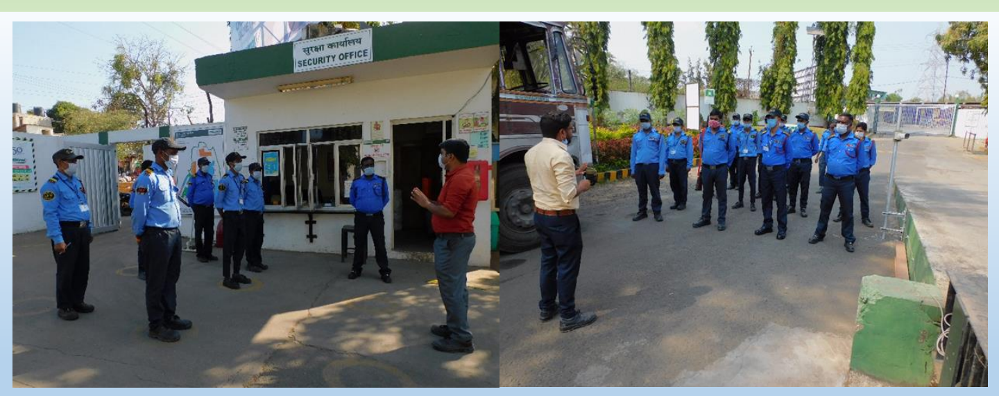
A training program for Security Personnel at Greases & Lubricants, Silvassa was organised in the month of February 2021.