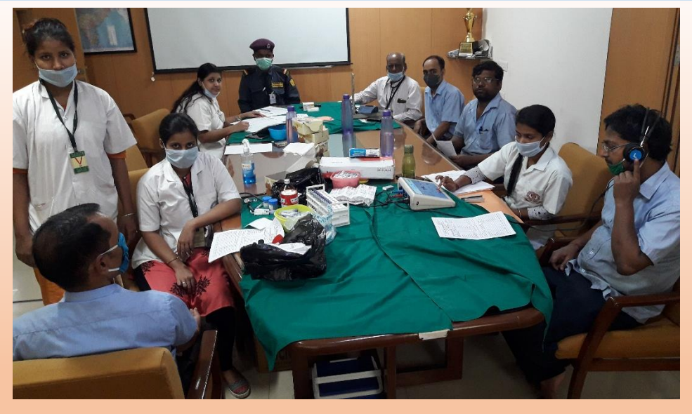
The annual Health check-up for employees at Industrial Packaging, Navi Mumbai was organised on 1<sup>st</sup> February 2021.