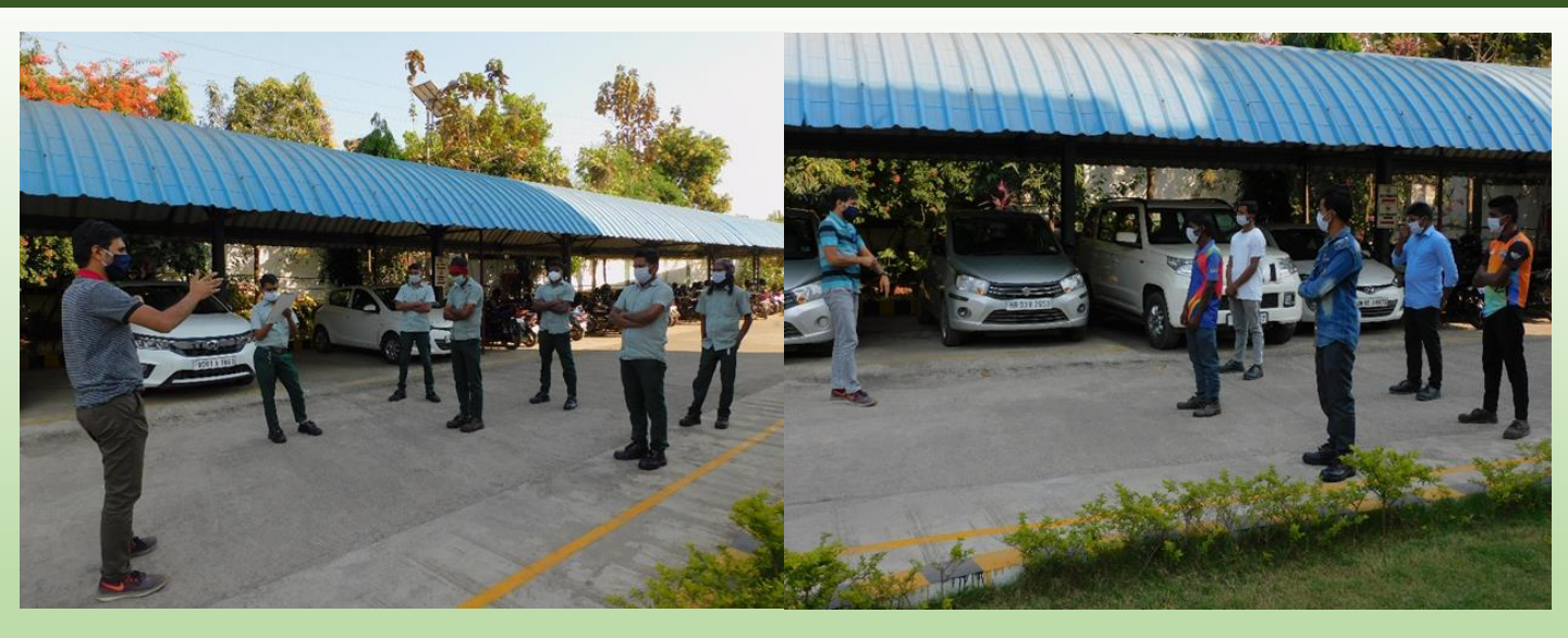
In Greases & Lubricants, Silvassa training sessions on prevention on COVID-19 are conducted on every Monday of the month. In photo are sessions being conducted in February 2021.