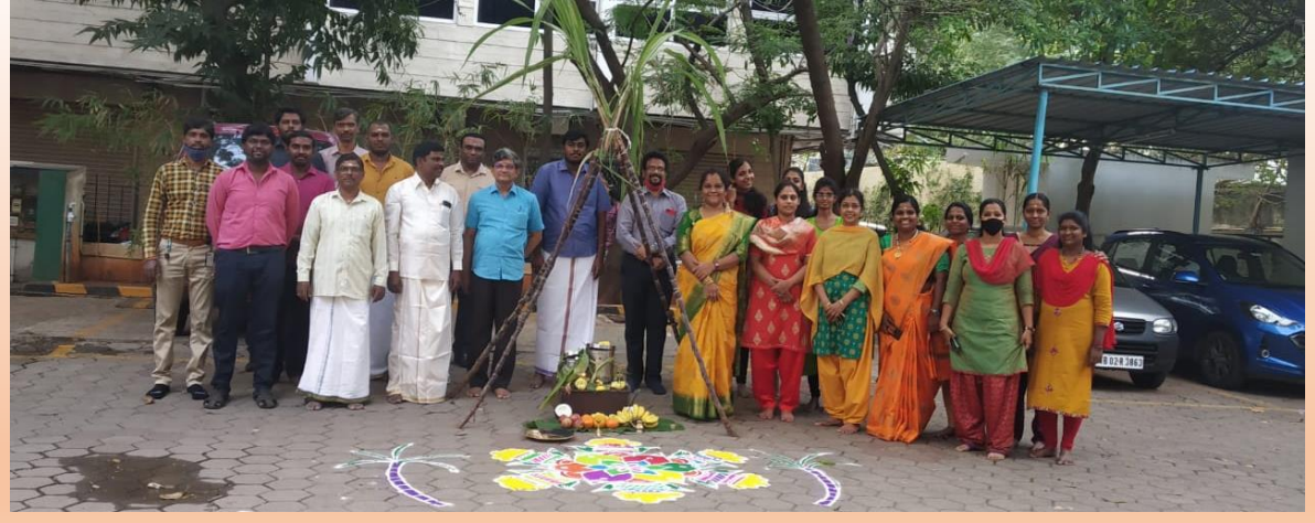
Pongal was celebrated with much fervour at the city office in Chennai on 13th January 2021.