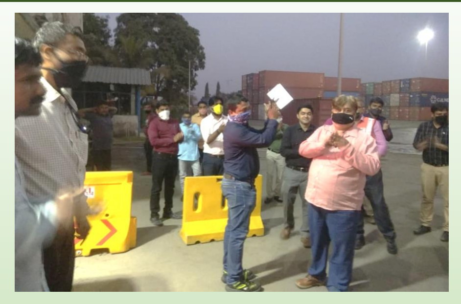
Surprise Mock Drill conducted at CFS, Navi Mumbai during the HSE Annual Audit in the month of January 2021