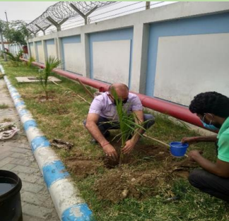
Tree plantation on the occasion of World Environment Day