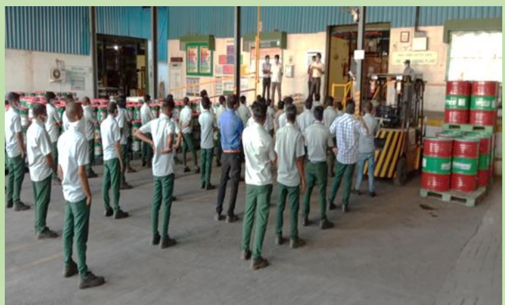
Awareness training program on COVID-19 at HO, Kolkata and G&L, Silvassa

World Environment Day was celebrated on 5 th June 2020 in units and establishments across locations. While all the manufacturing and service units organised sapling plantation to increase the green cover, an online quiz contest was organised for all employees to create awareness on key environmental issues. Winners of the contest were given away prizes.