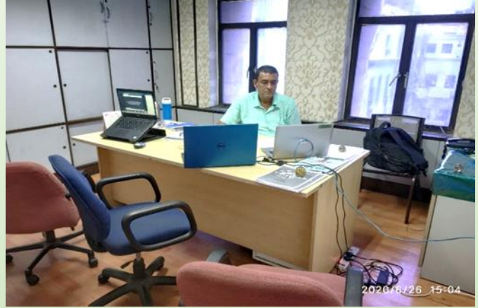
Online awareness program on COVID-19 on pan India basis