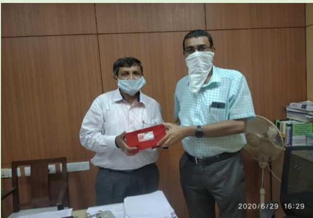
World Environment Day prize distribution