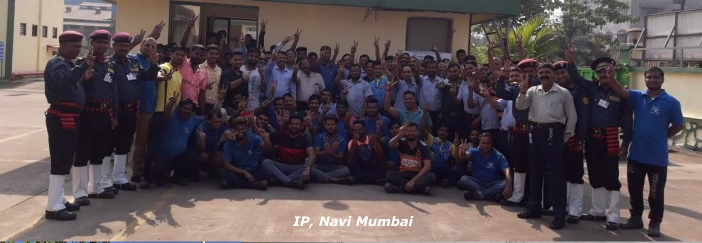
IP, Navi Mumbai