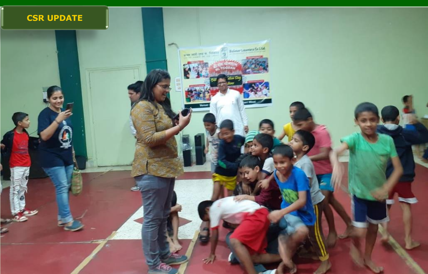
Balmer Lawrie employees from the Western Region voluntarily engaged with children in the YMCA boys' home at Andheri, Mumbai on 26 th January 2020 as part of CSR initiatives.