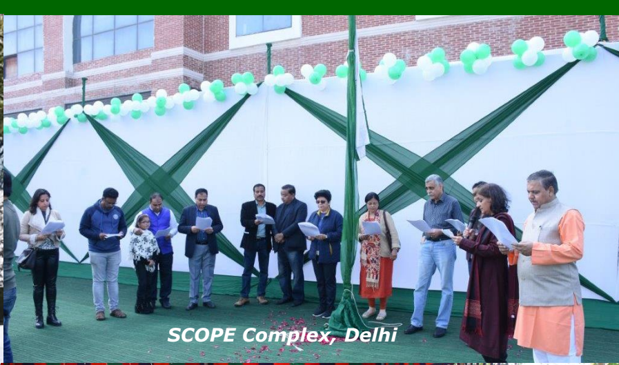
SCOPE Complex, Delhi