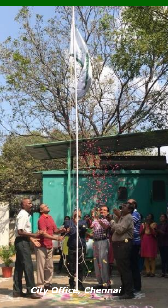
City Office, Chennai