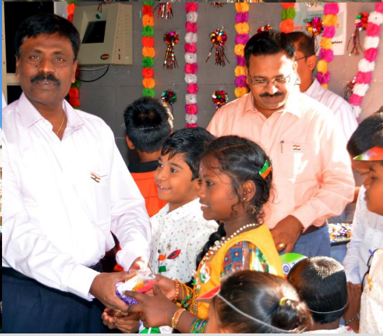
Republic Day was celebrated with much fervor in units and establishments across the Company. In photo are glimpses from IP - Kolkata, IP - Navi Mumbai, IP - Vadodara and Chennai.