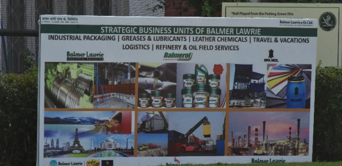
Balmer Lawrie associated with 'Hope Cup 2020', a charity golf tournament in aid of Indian Institute of Cerebral Palsy (IICP), as a tee sponsor. The tournament was organised by IICP along with Tollygunge Club at the Tolly Golf course on 24 th & 25 th January 2020.