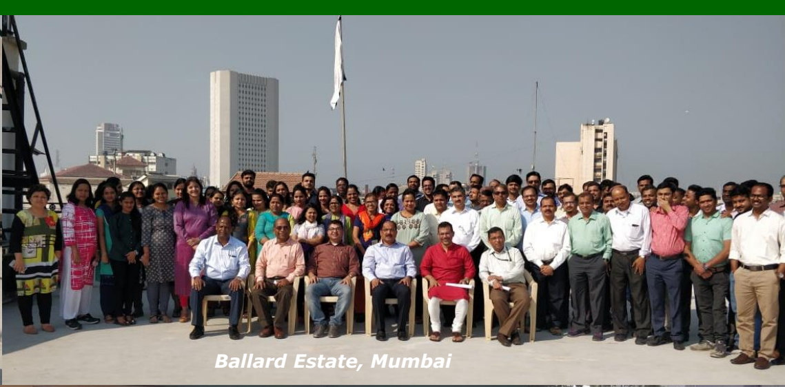
Ballard Estate, Mumbai