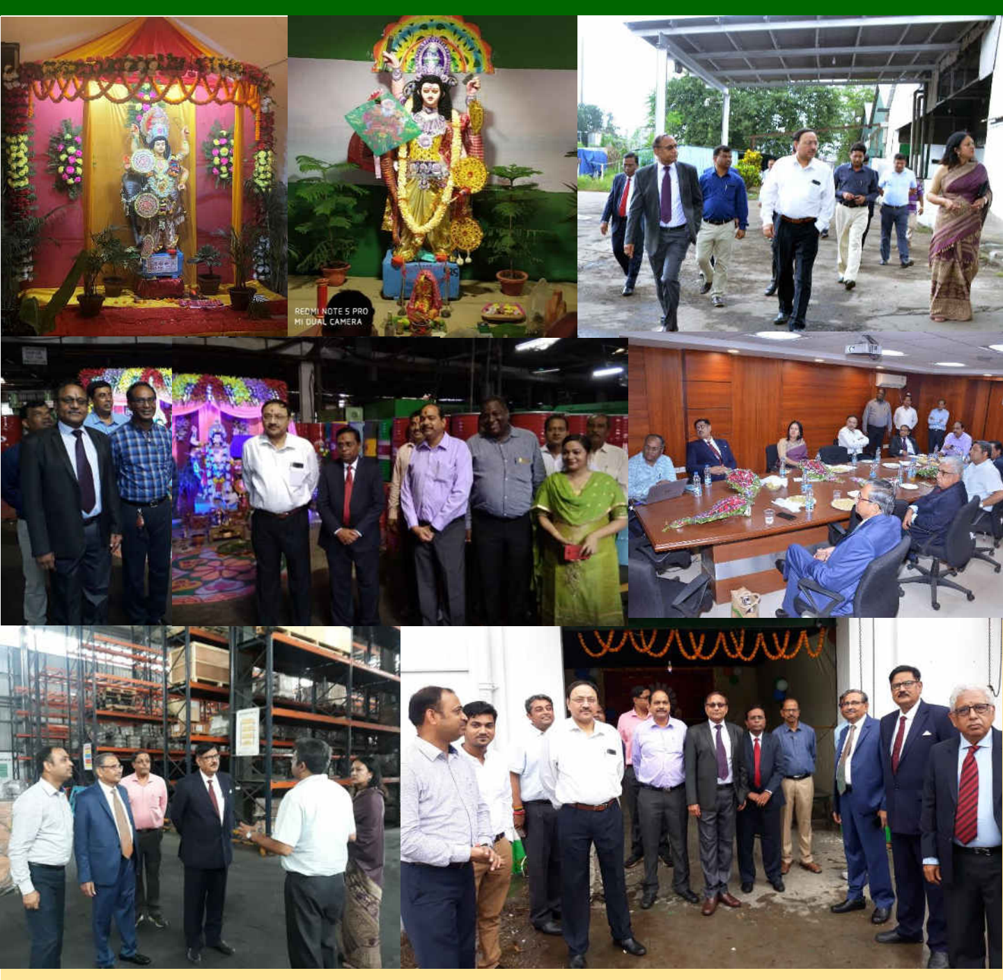
Vishwakarma Puja was celebrated with much fervour in the offices and plants of the Eastern Region on 18<sup>th</sup> September 2019. The Directors took time out of their busy schedule and visited HRC for the puja.