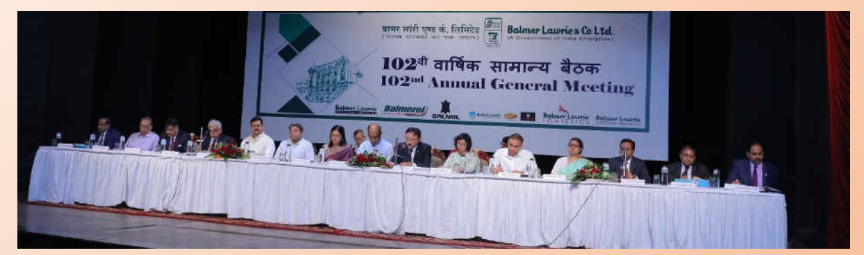
The 102nd Annual General Meeting at Kolkata; Seen in picture are the C&MD, Directors and Company Secretary

Every year in the month of September, Balmer Lawrie witnesses two significant events - The Annual General Meeting (AGM) of our Company and the Hindi fortnight celebrations. We also celebrate Vishwakarma Puja in our factories and offices in the Eastern Region in this month. The AGM this year was held at the Birla Sabhaghar in Kolkata on 18th September. Hindi Divas was celebrated on 14th September 2019. The Constituent Assembly of India adopted Hindi in the Devanagari script as the official language of India on 14th September 1949. The Hindi fortnight programs are being organised around this day in all the four regions across the country. In the Eastern Region the Hindi Pakhwara celebrations commenced on 14th September and would continue till 28th September 2019. Globally, Hindi is the fourth most spoken language in the world and in India around 50% people speak Hindi. As per census figures there has been an increase of 10 crore people speaking in Hindi from 2001 to 2011, thus, making Hindi the fastest growing language in the country. The importance of the Hindi language has been recognized by MNCs as well. Today, the popular search engines, news sites and online shopping sites are available in Hindi. It is interesting to learn that in the year 2017, the Oxford Dictionary for the first time included words like Achha, Bachcha, Surya Namaskar and Bada Din . Request all of you to proactively work towards enhancing the use of Hindi in our official work and communication.