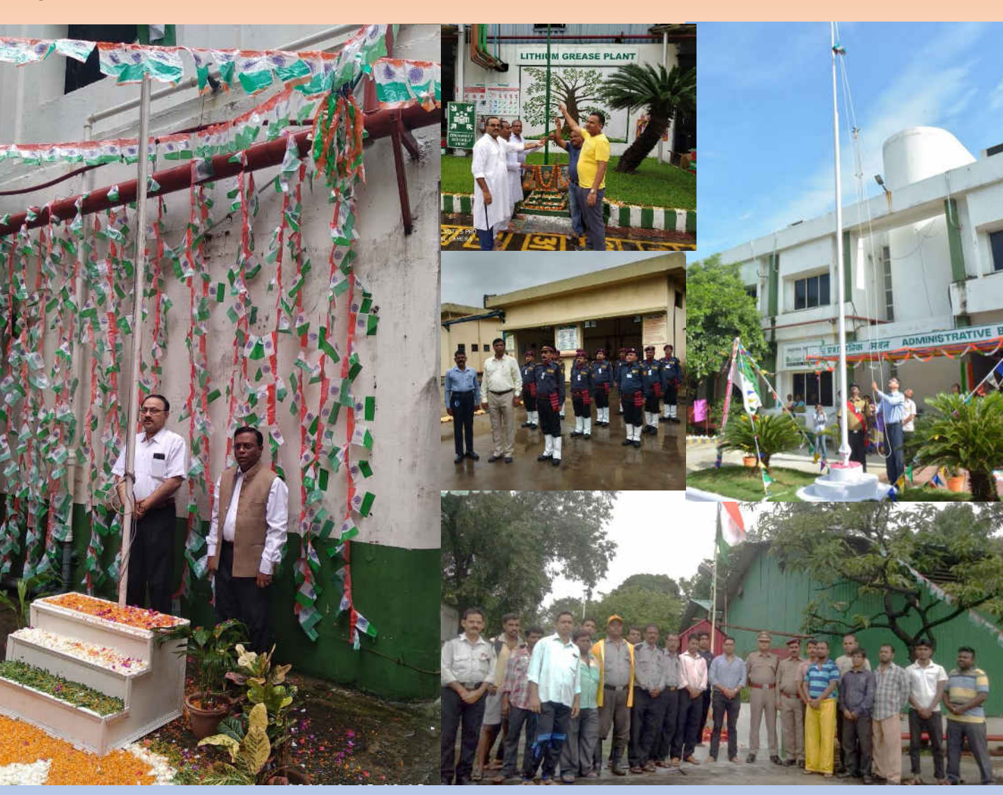
Independence Day was celebrated with much fervor in offices and plants pan India. In photo are glimpses of the celebrations from some units.

Regional HR organised awareness sessions on the new 'Group Mediclaim Insurance Policy for Officers' in the four regions across the country. The sessions were conducted by representatives of Marsh India Insurance Brokers Pvt. Ltd. new. In the Corporate Office and G&L – Kolkata, the sessions were conducted on 20<sup>th</sup> and 21<sup>st</sup> August 2019 respectively. In the Western Region offices, the sessions were organized on 22<sup>nd</sup> and 23<sup>rd</sup> August. Chennai had the session on 22<sup>nd</sup> August and Delhi had it on 23<sup>rd</sup> August.