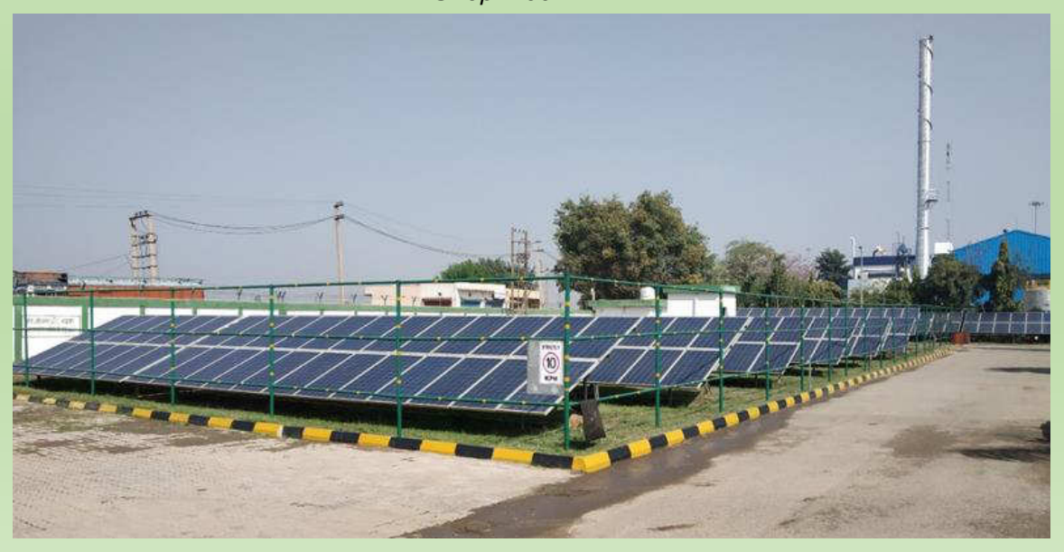
Solar power plant