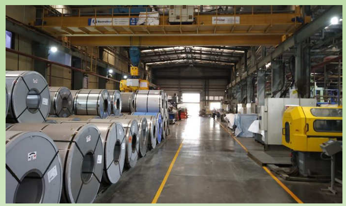
Steel coil storage area