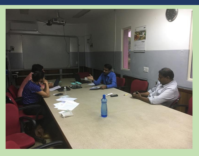
Meeting with vendors of SBU:LC