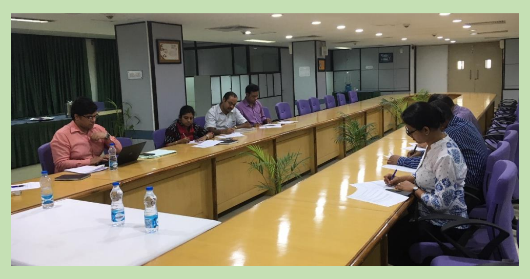
Employee engagement at the Corporate Office, Kolkata