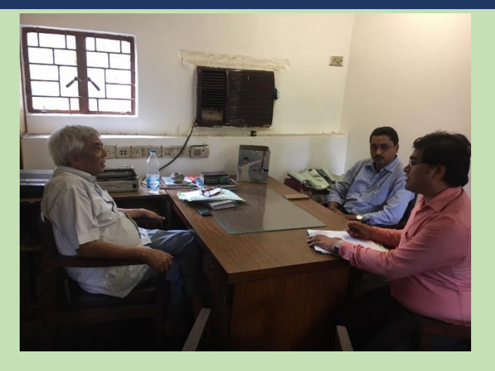
Meeting with a customer of SBU:G&L