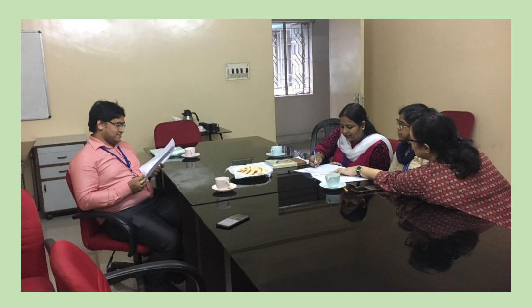
Meeting at the Indian Institute of Cerebral Palsy, Kolkata