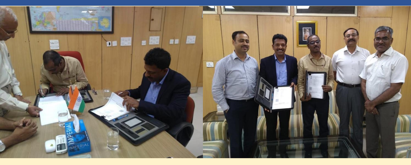
SBU: LI signed the agreement for "Operation & Management of Cargo Operations" of ICP Raxual with Land Port Authority of India (LPAI) in the month May 2018.