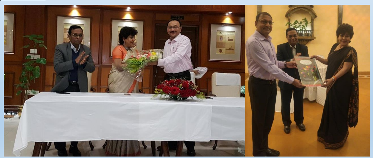
(L) C&MD felicitates D[HR&CA] during the farewell function at the Corporate Office, Kolkata; (R) D[S] hands over a greeting card to D[HR&CA] during the farewell function organised by the Top Management team