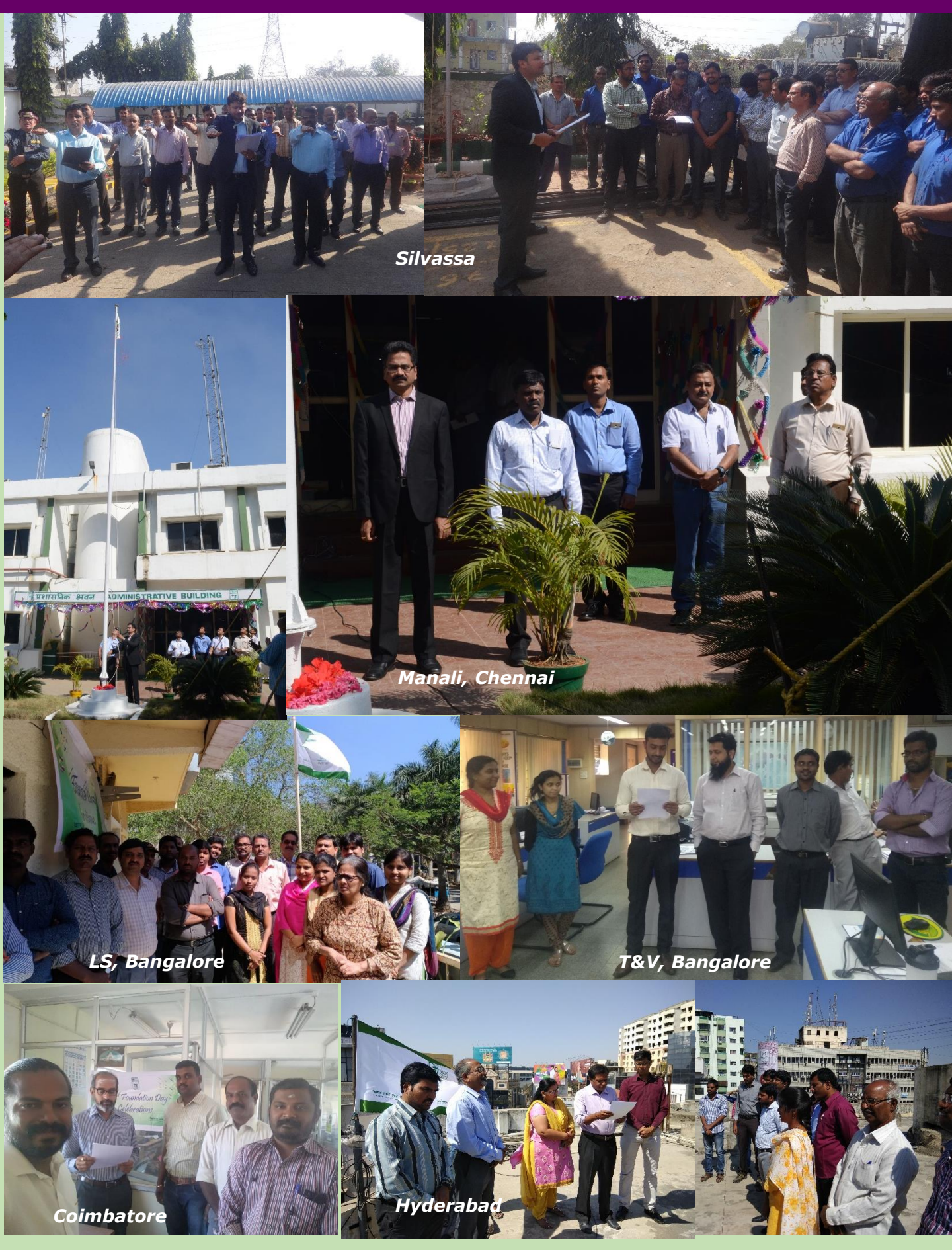
Our Company completed 151 years on 1<sup>st</sup> February 2018. To mark this occasion, the Balmer Lawrie flag was hoisted, the pledge was administered and C&MD's message was read out at all locations. The long service awards were given away and employee activities were organised in some locations. In photo are glimpses from various locations. Watch out for more on the celebrations in the April 2018 issue of Balmer Lawrie Organisational Gazette (BLOG).