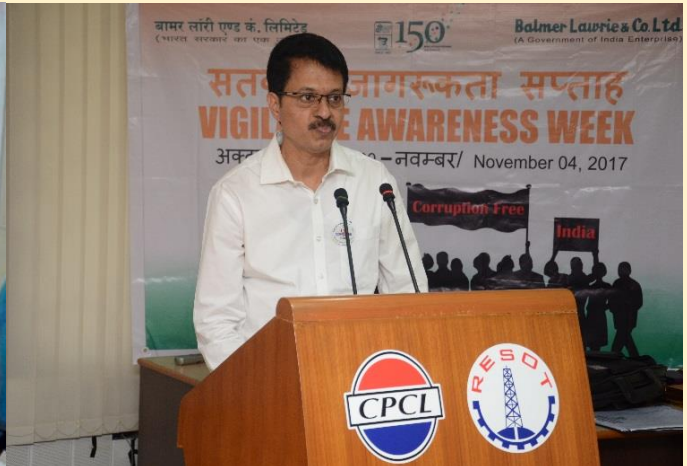
Vendor Meet at Chennai