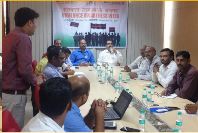
Vendor Meet at IP, Navi Mumbai