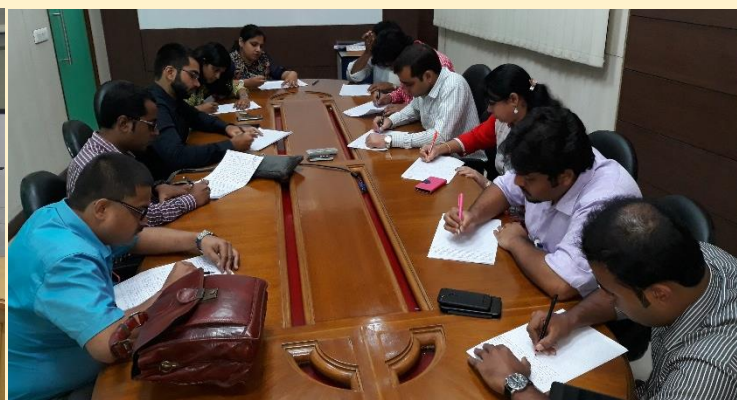
An essay competition in progress at HO, Kolkata