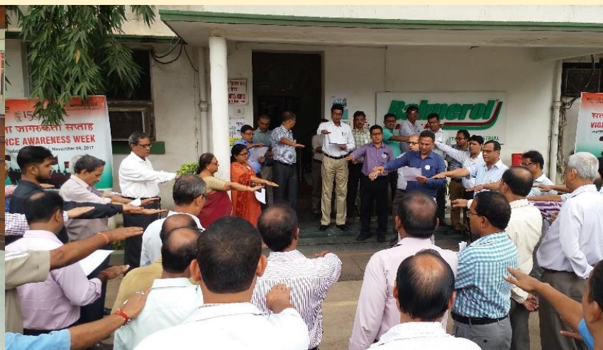
C&MD administers the Vigilance pledge in HO, Kolkata in the presence of D[HR&CA] and D[M]