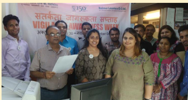
The Vigilance pledge being administered in T&V, Ahmedabad