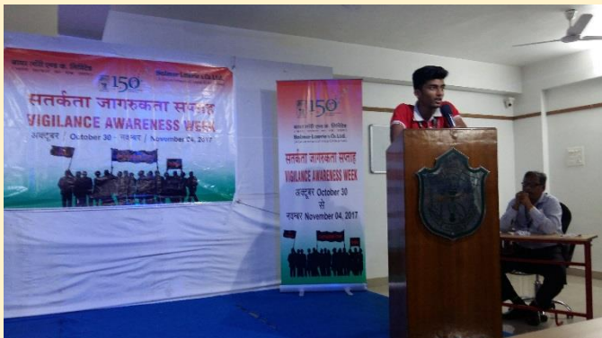
Vendor Outreach Program in DPS, Kolkata