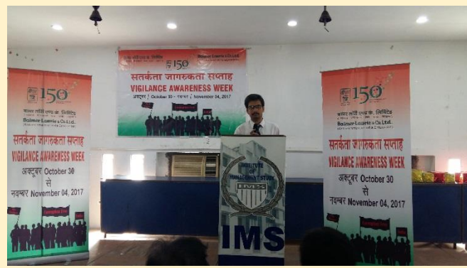
Outreach Program in IMS, Kolkata