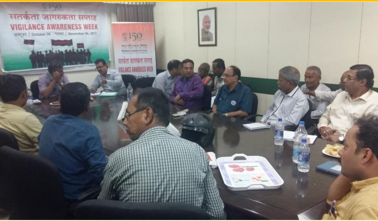
Vendor Meet at G&L, Kolkata