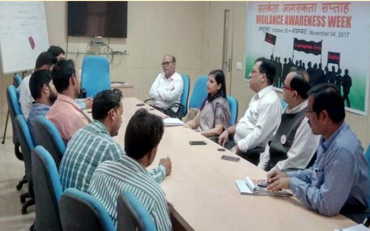
Vendor Meet at Delhi