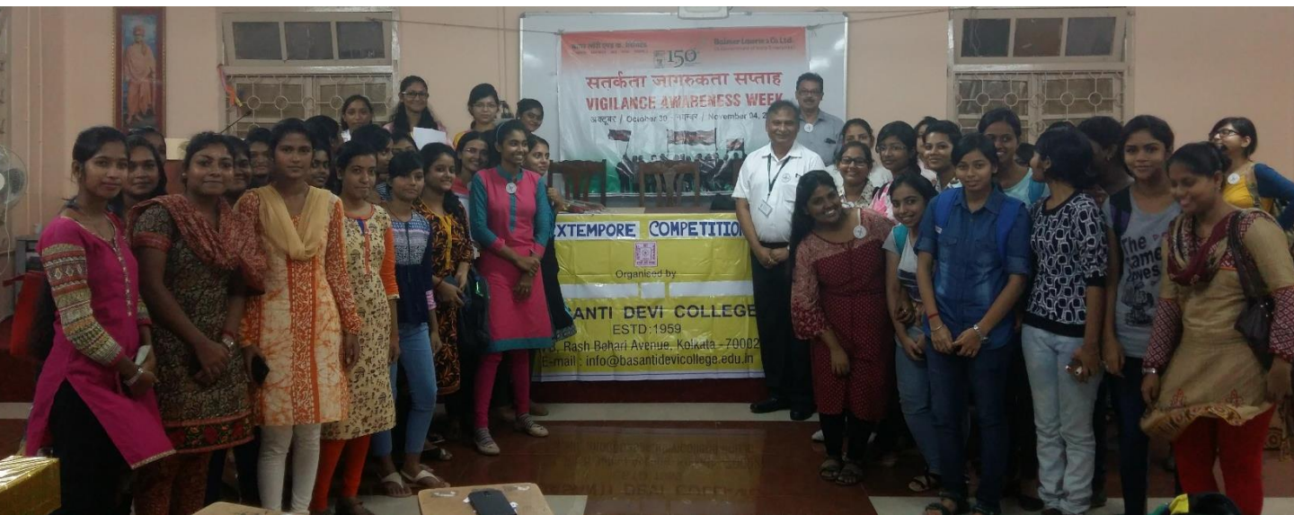
An extempore speech competition was organized in Basanti Devi College, Kolkata