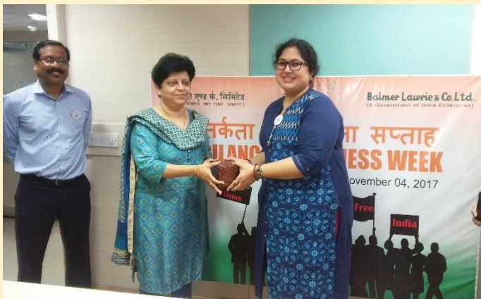
Prize Distribution Function in Delhi