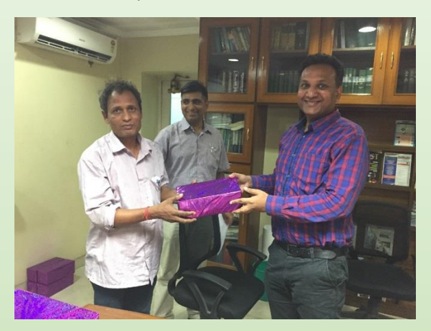
Pries being given away to Spot the Hazard contest winners at G&L, Kolkata