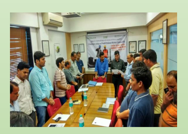
Safety Pledge at CFS, Mumbai