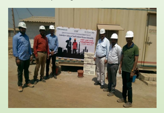
Safety Pledge at MMLH, Vizag