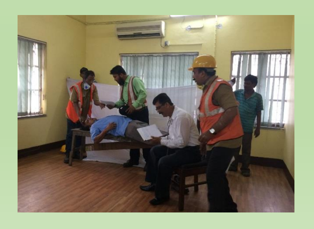
Safety Skit Competition at G&L, Kolkata