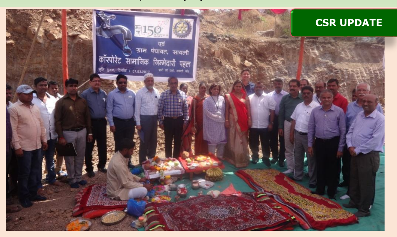
As part of CSR initiatives undertaken in Sayali Village near our Manufacturing Units at Silvassa, a bhoomi pujan for the construction of an overhead tank was done in early March 2017.