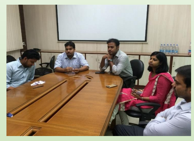
Extempore Competition at Corporate Office, Kolkata