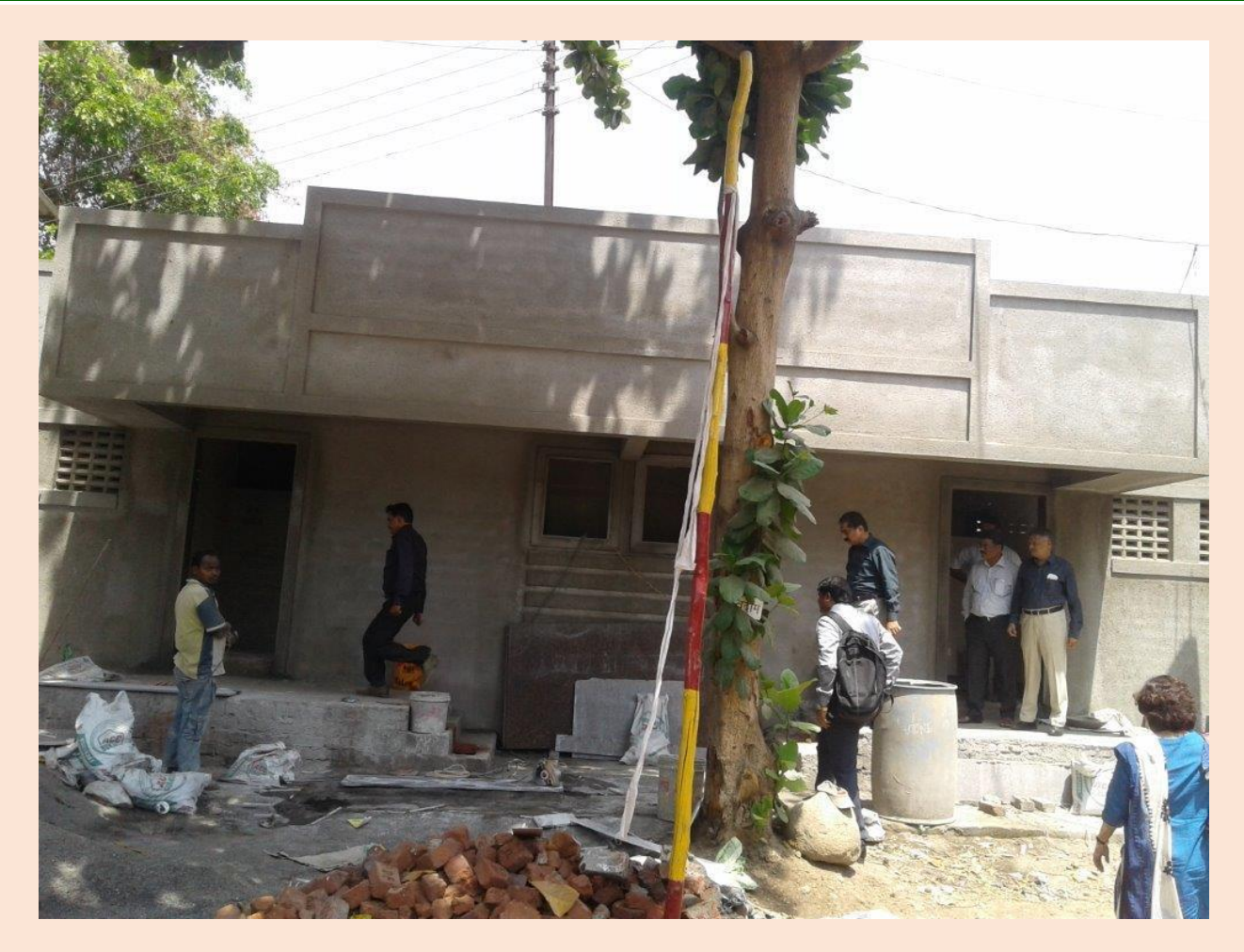
Toilet blocks for boys and girls were constructed at the Chatrapati Shivaji Vidyalaya, Palspe, Panvel.