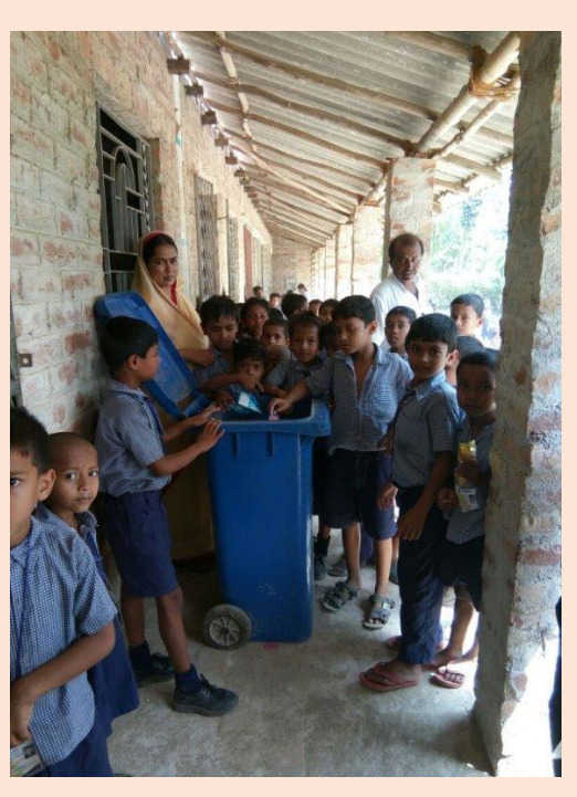
Use of Dustbin by Students

As part of the Swachh Bharat Abhiyan, toilets were constructed in schools in the Western Region. Toilet maintenance work was undertaken on need basis and dustbins were distributed in schools in West Bengal, which are being used by students.