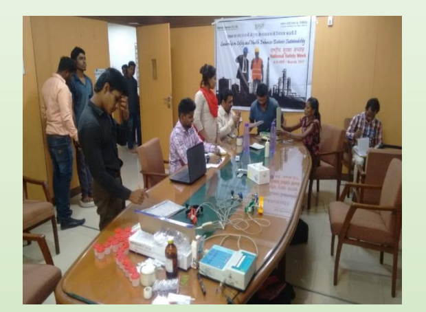
Health Check-up Camp at IP, Taloja (Navi Mumbai)