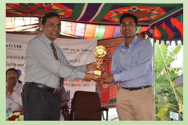
Director [Manufacturing Businesses] handed over prizes to the winners at Chennai