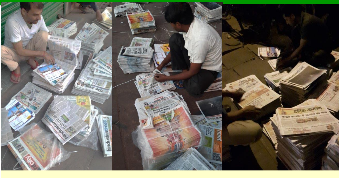
Vacations Exotica of our SBU:T&V also advertised by inserting pamphlets of holiday packages in newspapers of six areas in the Delhi region from 14<sup>th</sup> to 16<sup>th</sup> April 2016.