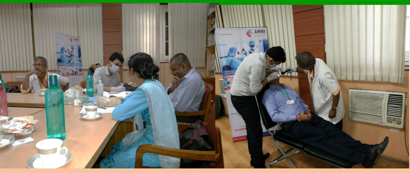
A Dental Camp for employees was organised on 15<sup>th</sup> April 2016 at the Corporate Office in Kolkata, in association with AMRI Hospital.