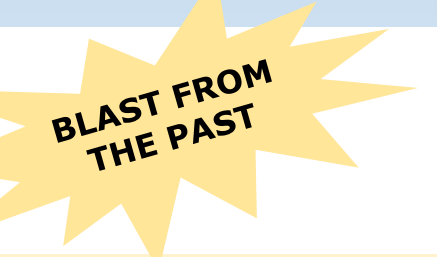
Balmer Lawrie was appointed Managing Agents for New Beerbhoom Coal Co. Ltd in the year 1891.

बामर लॉरी परिवार में आपका स्वागत है एवं आपलोगों को हार्दिक शुभकामनाएं । Welcome you to the Balmer Lawrie family and wish you all the best!