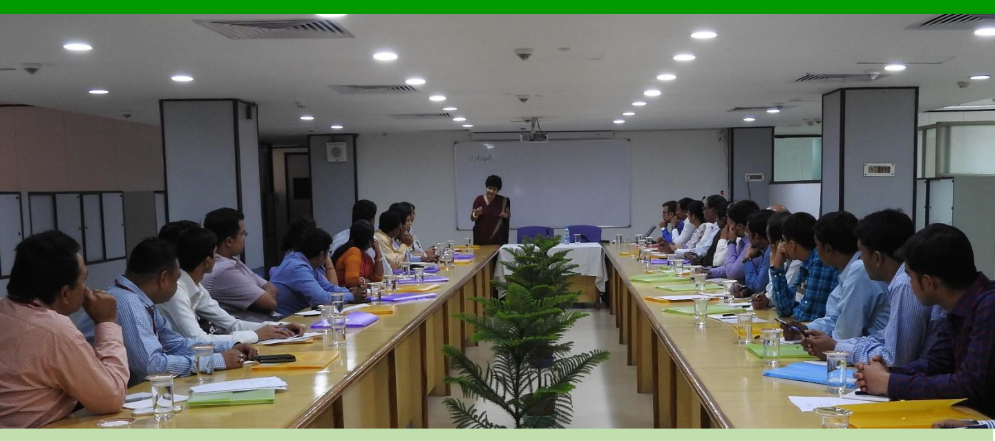
The session at Kolkata was held on 24th November at the BL Training Centre