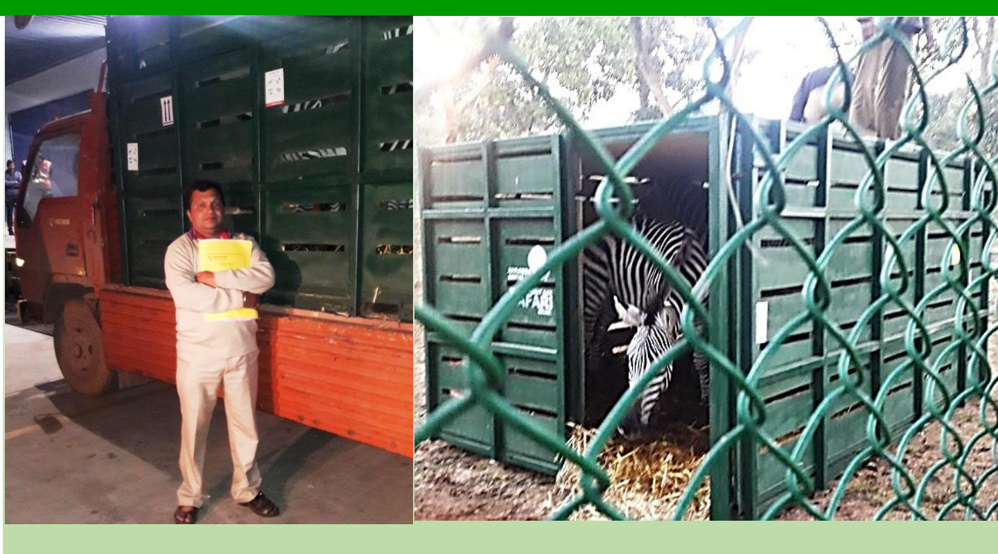
Logistics, Bangalore successfully handled the Customs clearance for the import of four zebras, as part of an exchange program, from Israel to the Bannerghatta National Park, Bangalore on 26<sup>th</sup> November 2015. The zebras were brought to Bangalore by Lufthansa.