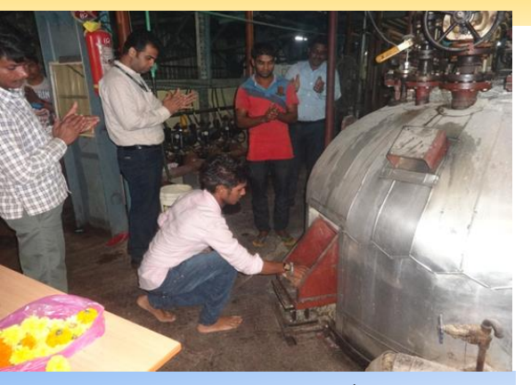
Diwali Puja was held on 9<sup>th</sup> November at G&L – Silvassa.