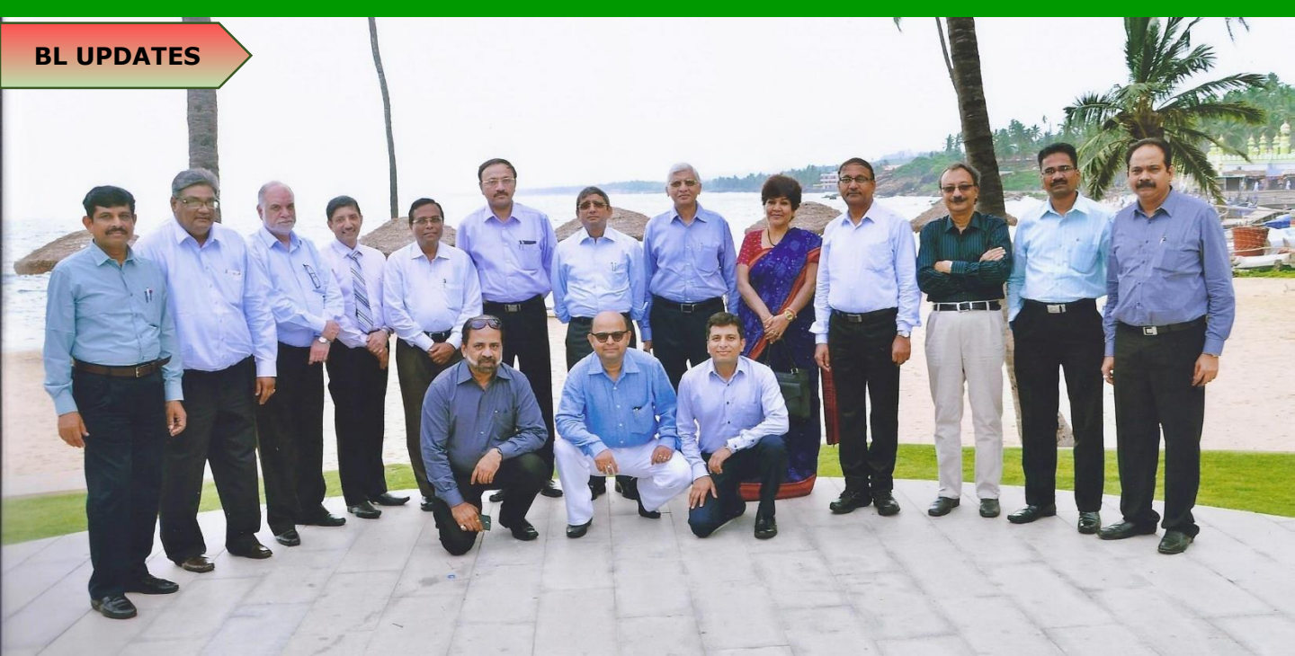
The Top Management Meet was held at Kovalam on 28 th & 29 th May, 2015.