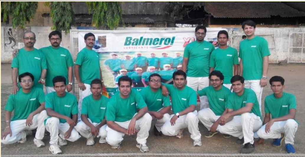
Employees from Silvassa participated in the "Industrial Night Cricket Tournament" organized on 20 th May.