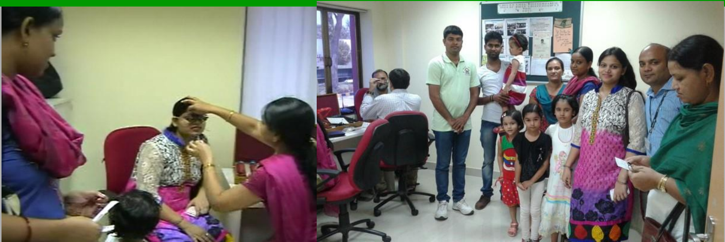
An eye check up camp was organized at G&L, Silvassa on 10 th May for employees, their families and local villagers. Around 248 people were checked and 138 pairs of spectacles were distributed.