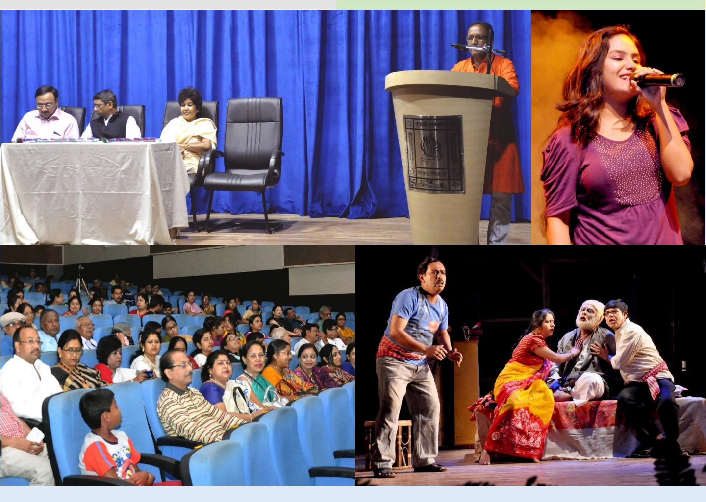
Balmer Lawrie Recreation Club organised the Annual Drama and Cultural Program at Uttam Manch, Kolkata on 8<sup>th</sup> March. Present on the occasion were C&MD, D[F] and D[HR&CA].