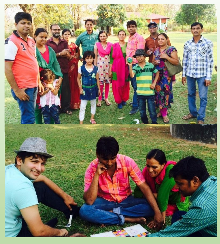
A picnic to Dudhani was organized on 21<sup>st</sup> March for family members of officers staying in Silvassa, as part of the employee engagement initiatives taken there.

The wives and children of officers of G&L, Silvassa were shown around the factory premises, on an off day, in the month of March 2015, so that they could get a feel of where their husbands/fathers are working. This initiative was taken by the HR Team at Silvassa as part of employee bonding activities.