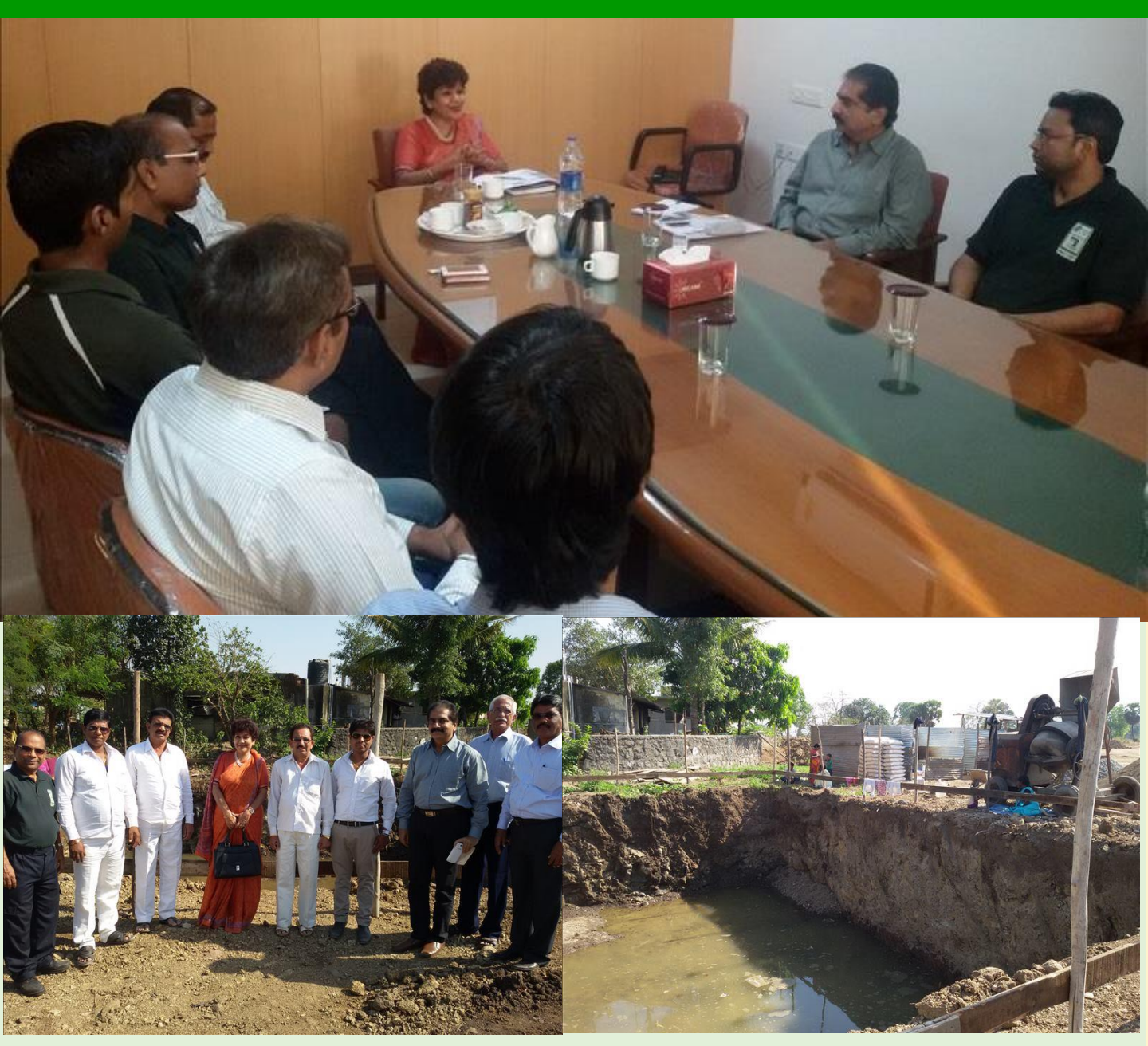
On 17<sup>th</sup> March, Director [HR&CA] visited IP, Navi Mumbai and other units in the western region. She initiated "Employee Connect" and also visited Padghe Village, Panvel for an inspection of the construction of the overhead and underground water tank, which is an ongoing CSR project. Rotary Club of Panvel Industrial Town Charitable Trust is the Implementation Partner.