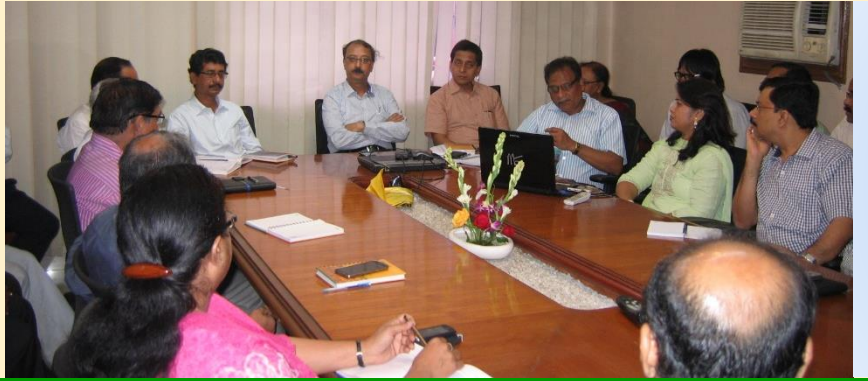
On 1^{\text{st}} April 2015 a Vigilance Awareness session was organized at G&L - Kolkata which was chaired by COO[G&L].