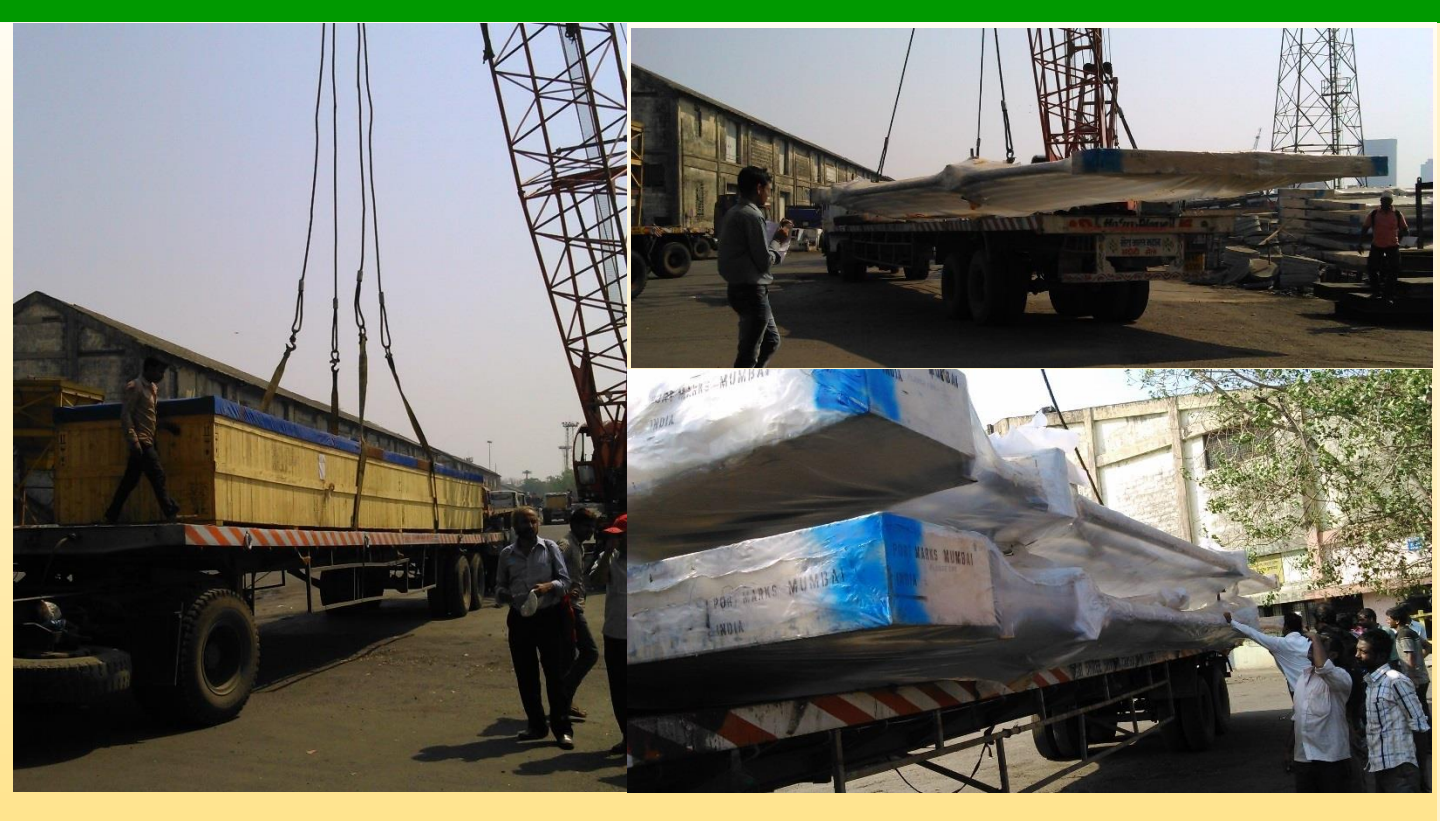
LS, Ahmedabad handled freight and customs clearance for the break-bulk movement of 200MT/800cbm, Ex Hamburg. The shipment was successfully cleared by Mumbai office in a single day on 9<sup>th</sup> March 2015, which was highly appreciated by the customer, IFFCO.