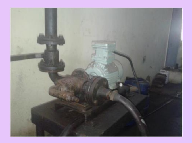
Flame proof motor installed for HSD transfer pump