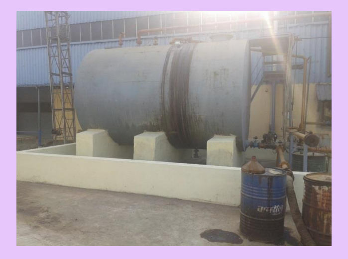
Secondary containment made for base oil storage tank