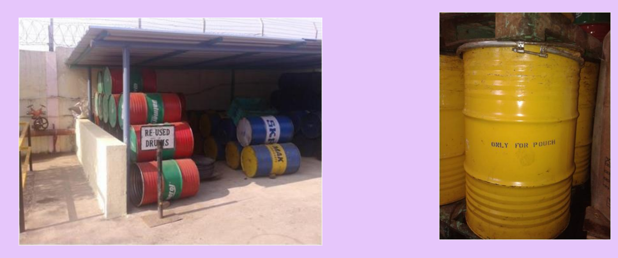
Used & reusable barrels are properly labeled & segregated for easy identifications