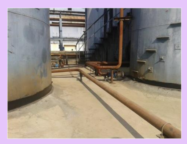
Double body earthing of all tanks