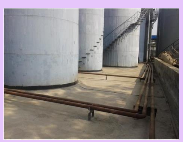
Concretizing of tank farm yard