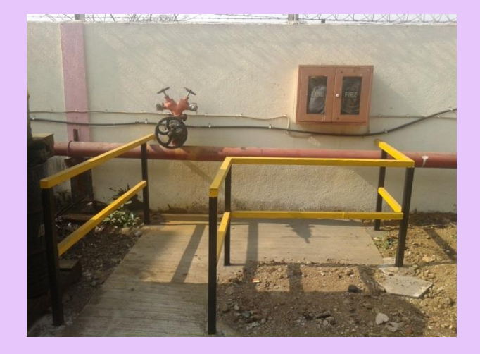
Barricading done in front of fire hose box for free access during emergency