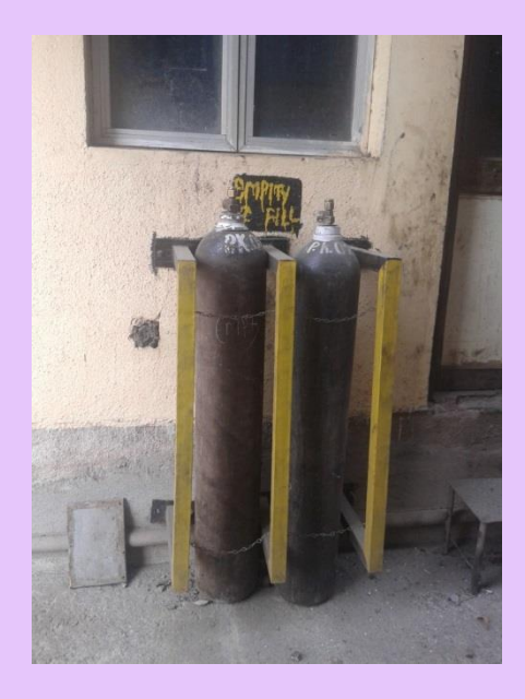
System to stack cylinder vertically with chain