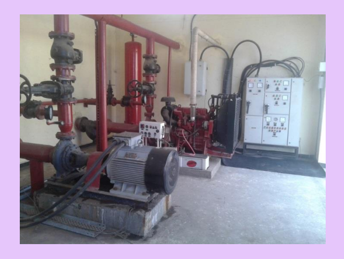
Completion of fire hydrant system, including main & jokey pump