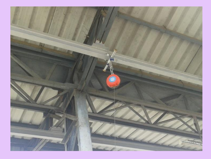
Fall arrest system installed for people working on tanker top