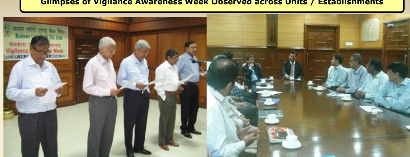
Glimpses of Vigilance Awareness Week Observed across Units / Establishments