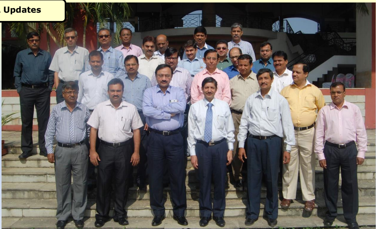
The Accounts & Finance Meet was held at Haldia on 22 nd & 23 rd November, 2013.