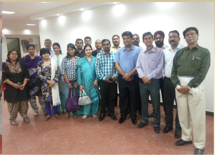
A training program on Service Excellence for Officers /Jr. Officers of SBU: T&T was organized at Russian Culture Centre, New Delhi on 9 th & 10 th November. 25 employees participated in the program.