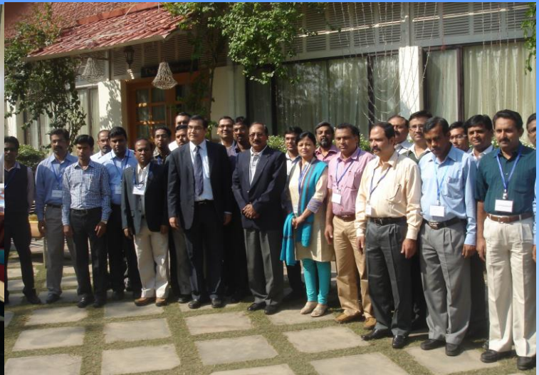
A Dale Carnegie training program titled "Communicating with Impact" was organized for Junior Management Executives on 15 th & 16 th November at Mumbai and on 21 st & 22 nd November at Kolkata.