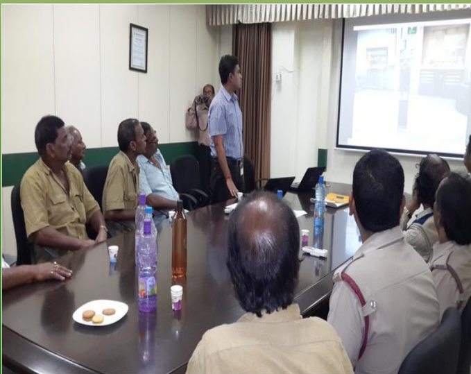
Workshop at CFS, Kolkata