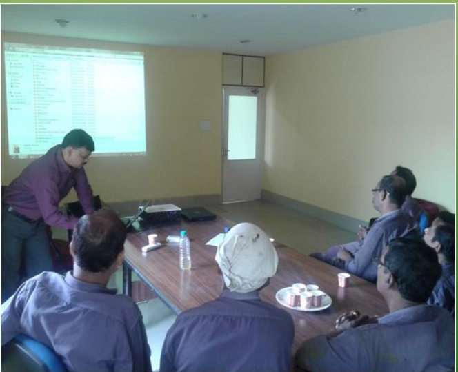
Workshop at IP, Kolkata