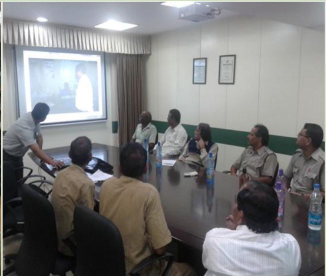
Workshop at CFS, Kolkata for W&D staff