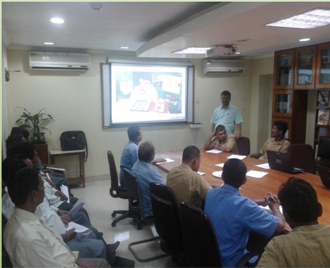
Workshop at G&L, Kolkata

Conducting workshops and sensitizing people plays a critical role in our pursuit of Sustainable Development. In the month of November more than 70 employees were engaged in HSE, SD & CSR workshops in 3 different batches at G&L and CFS in Kolkata.