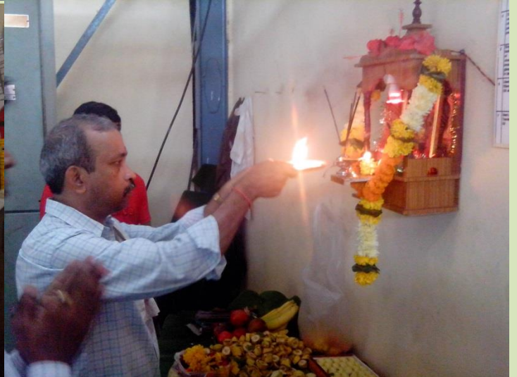
Vishwakarma puja was celebrated with much fervor across various units and establishments of the Company on 17 th September 2013. In photo are glimpses of the puja at G&L - Kolkata, IP - Kolkata, CFS - Kolkata and G&L - Silvassa.