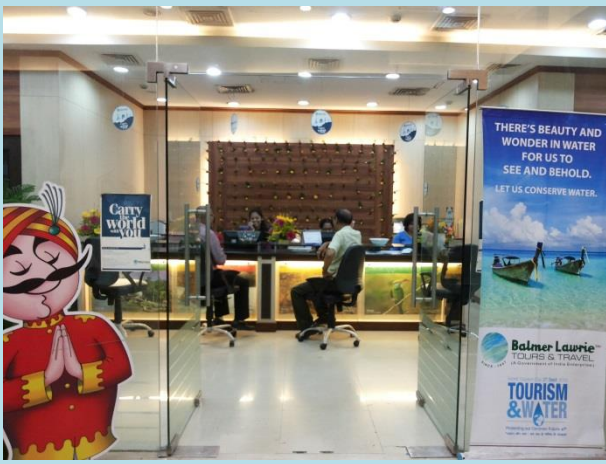
World Tourism Day was observed at T&T, Kolkata and other branches on 27 th September, 2013. The theme was Tourism & Water - Protecting our Common Future.