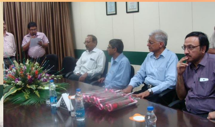
Every year children of BL employees are recognised by the Company for performing well in the 10 th /12 th or equivalent examinations. The ceremony was organised at CFS Kolkata on 17 th September where more than 38 such meritorious students were given away awards by C&MD in the presence of Directors and other officials.