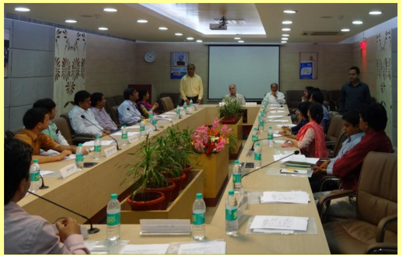
On 28 th September, 2013 a Hindi Workshop was organized in Delhi. 27 employees from the northern region participated in the workshop.