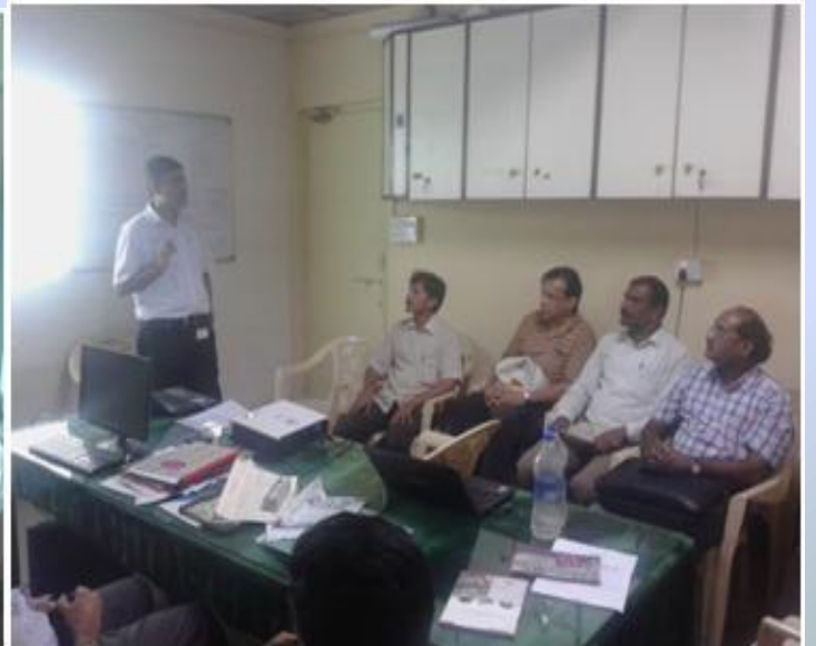
Workshop on SD for External stakeholders

In the month of September workshops on HSE, SD & CSR were conducted for more than 220 employees in 6 different batches at Silvassa & Mumbai. External stakeholders were also engaged during a session on CSR & Sustainability in two different batches at Silvassa.