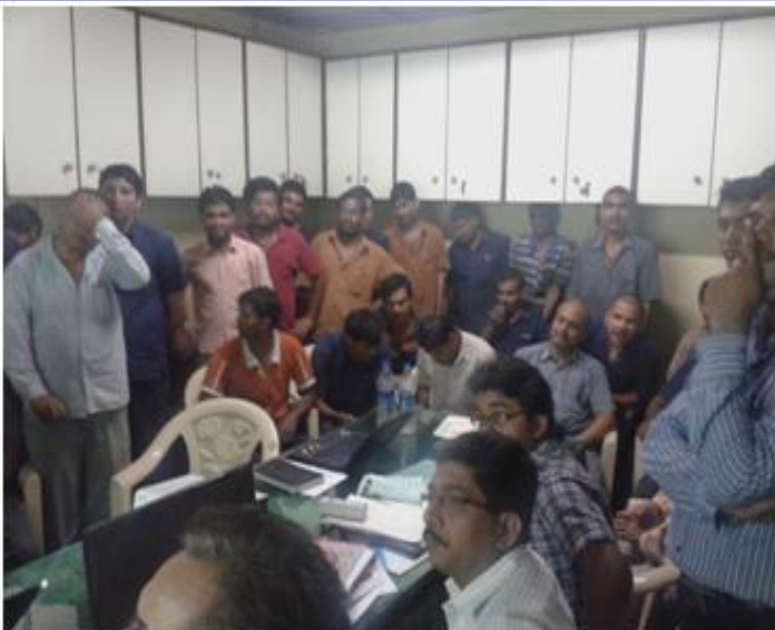
Workshop at IP Silvassa