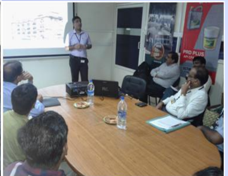
Workshop at G&L Silvassa