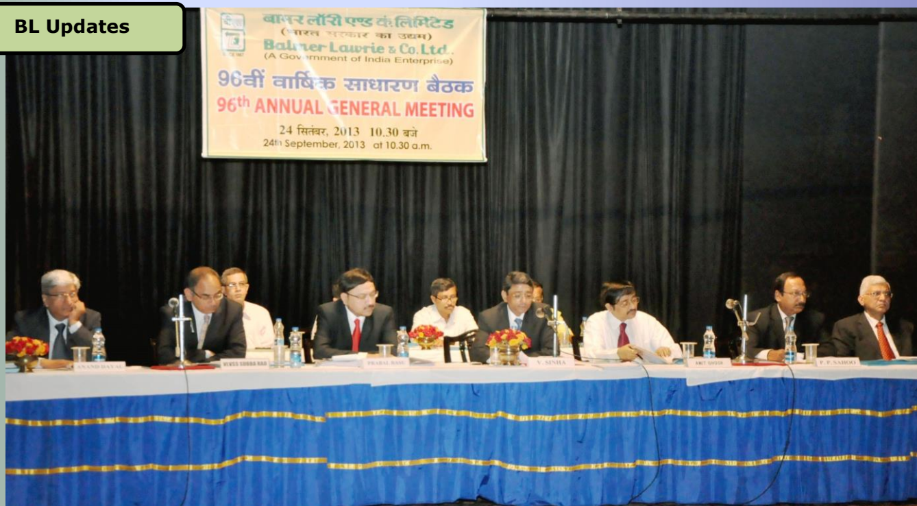
The 96th Annual General Meeting of the Company was held on 24th September at the Birla Sabhaghar in Kolkata.