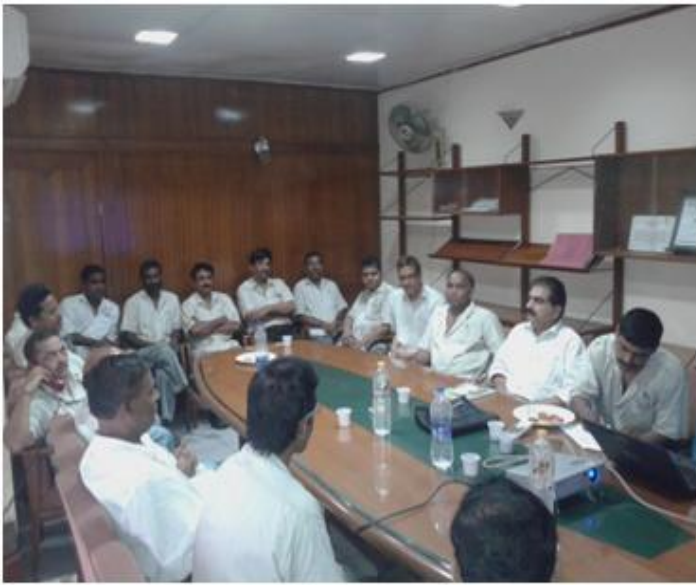
Workshop at G&L Sewree