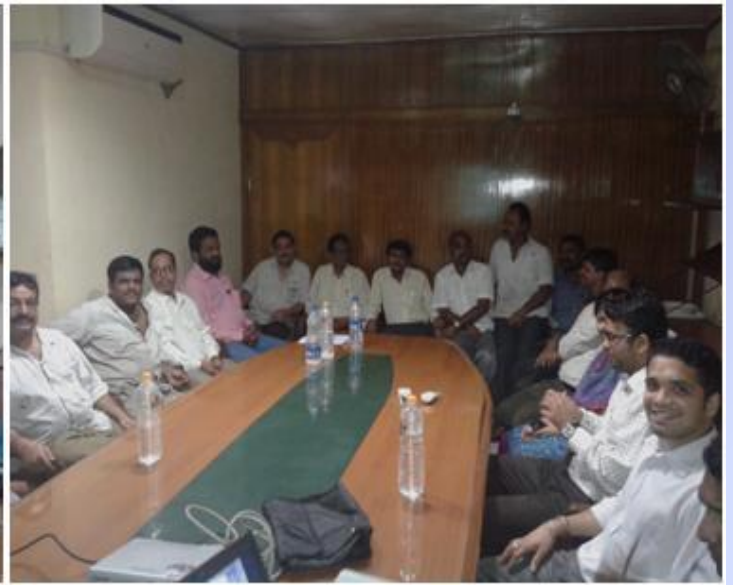
Workshop at IP Sewree