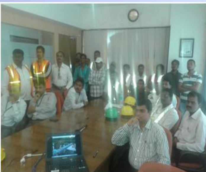
Work shop at CFS Mumbai