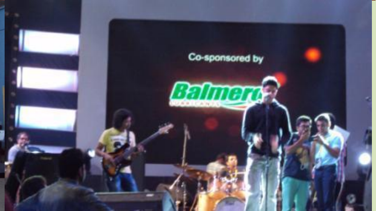
Balmerol was one of the Co-sponsors of the "Farhan Live Rock On" Concert held on Friendship Day, 4 th August 2013 at Netaji Indoor Stadium, Kolkata. Balmerol Race 4T, Super Star and Biker 4T targeted at the 2 Wheeler segment were promoted during the event.