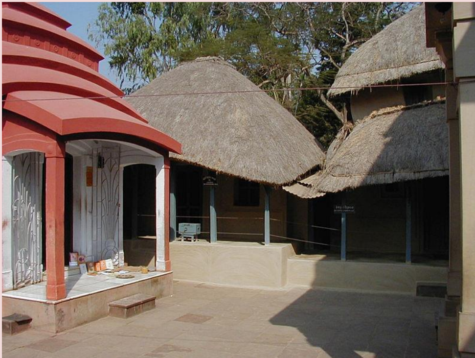
The small house at Kamarpukur where Sri Ramakrishna lived (centre); the family shrine is on the left and the birthplace temple is on the extreme right.

Kamarpukur village situated in Hooghly District is famous for being the birthplace of Sri Ramakrishna Paramahansa. This hamlet is a place of pilgrimage and thousands visit it every year from the various parts of the world. A beautiful temple of Sri Ramakrishna with his marble statue was built in 1951 at Kamarpukur. With the construction of guest houses, a library, a dispensary and schools and the re-excavation of the tank called Haldarpukur, along with the development of the surroundings, the village has become a place of tourist attraction.