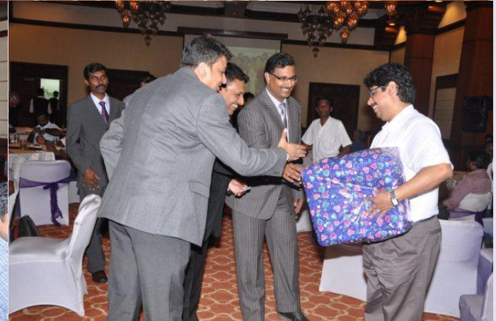
CFS, Chennai organised a CHA Meet on 12th July 2013 at Hotel GRT Grand, Chennai. The Meet was well attended and the response from customers was very good. During the Meet, a presentation on SBU: LI was made, followed by an interaction with the participants. There was a lucky draw for the guests.