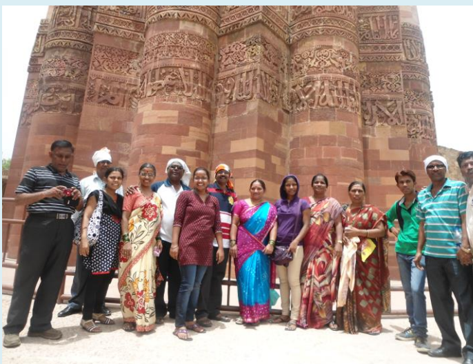
Kashmir Tour for Customs, Mumbai from 26th May to 7th June, 2013