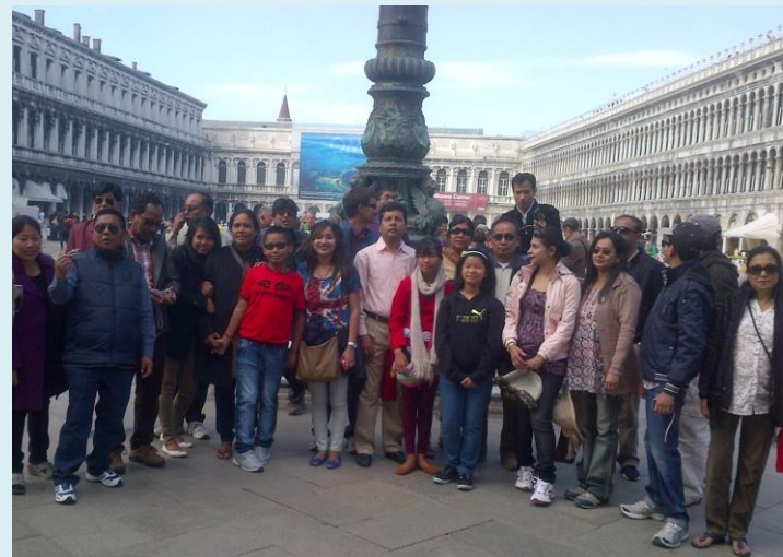
Europe Tour for IOC (Assam) from April 13th to 22nd, 2013