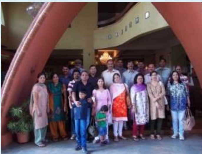
Educational Seminar on Bancassurance for Star Union Dai-ichi Life Insurance Co. Ltd. held at Goa

Tours, Mumbai successfully organised tour programs for various organisations, over the last few months.