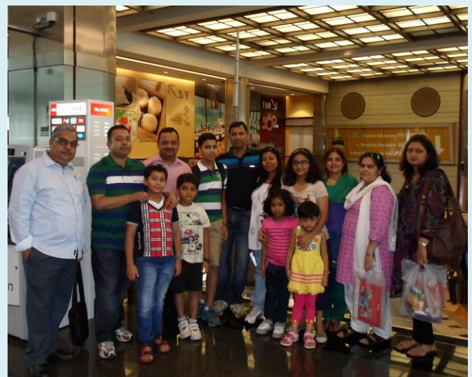
Hong Kong and Macau Tour for IOC, Uttar Pradesh from 10th to 16th June, 2013