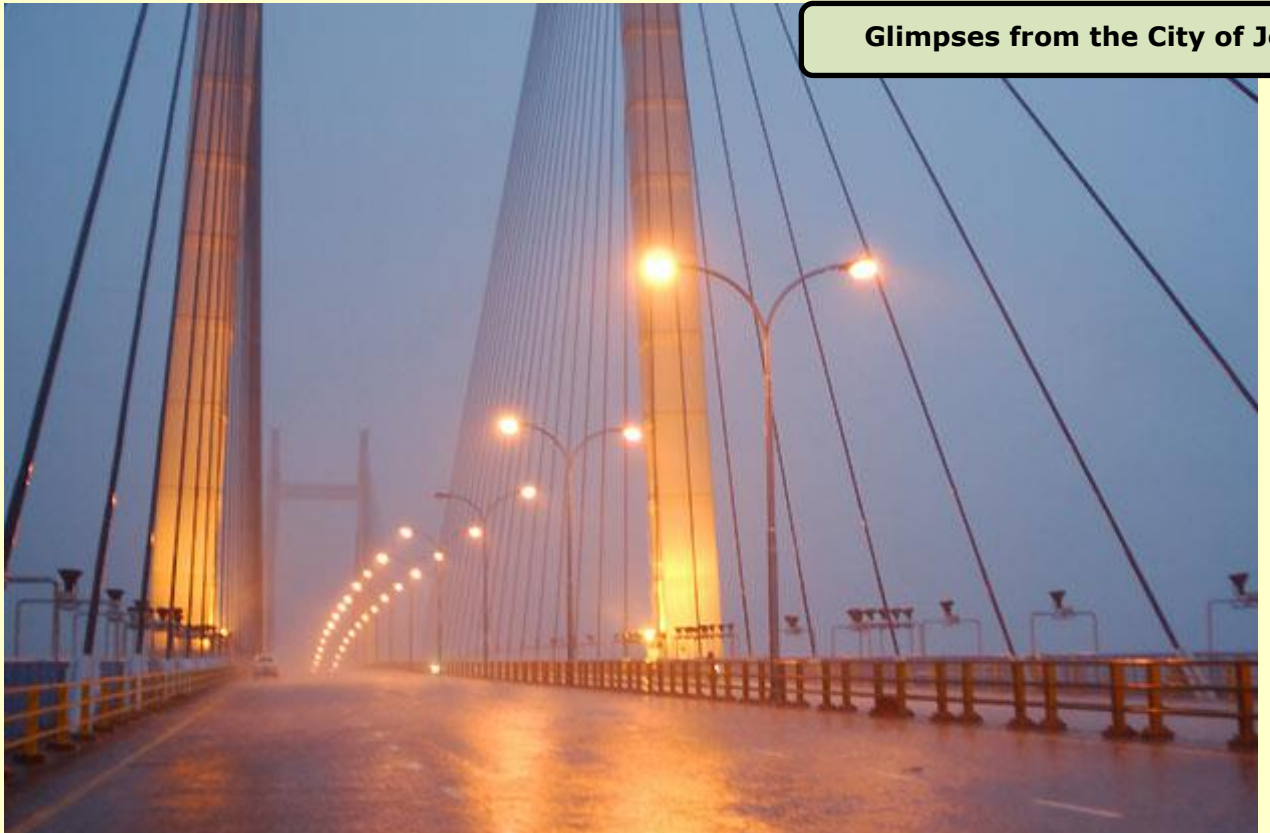
Glimpses from the City of Joy