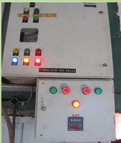
Variable frequency drive