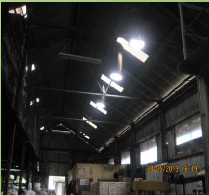
Use of Natural Light in shop floor