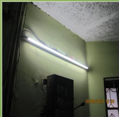
Conversion to T5 Lamps