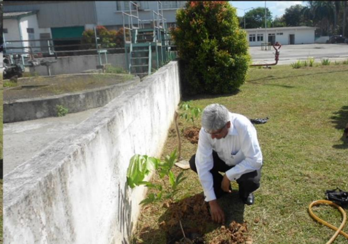
C&MD and Director [Manufacturing] visited PT Balmer Lawrie Indonesia on 3rd and 4th June, 2013. They attended the meeting of the Board of Commissioners and went on a factory inspection. They also planted saplings of the Rambutan tree which belongs to the litchi family on the eve of World Environment Day.