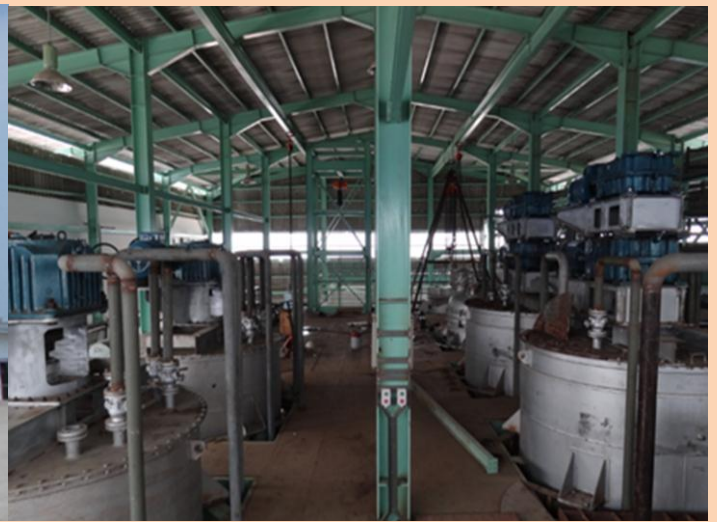
(In photo - Grease Processing & Lube Oil Blending Plant and Grease Processing Zone)

Engineering & Projects Department was retained by PT. Balmer Lawrie Indonesia as Project Management Consultant for implementation of their Grease Processing & Lube Oil Blending Plant at Cikande-Indonesia. After putting in 17 months of hard work, the team completed the project, and the plant was ready for commissioning.