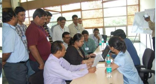
A training program "Build Our Future Together" was organised on 29 th and 30 th of July for the BL IT team at Kolkata. The objective of the program was to impart skills on team working which would help to enhance internal customer satisfaction. Glimpses of the training program are seen in photos.