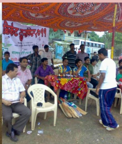
As part of the CSR initiative, a cricket tournament was organised at model village Khadoli. 12 teams participated in the tournament, which was organised by Rotary club of Silvassa and sponsored by Balmer Lawrie.