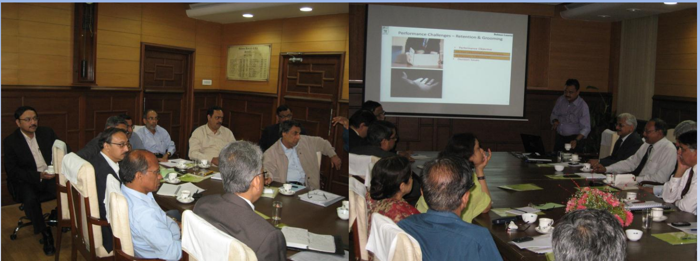
A Top Management Meet was held at HO in Kolkata on 29 th December to take stock of the financial performance of the Company and chalk out strategies for the remaining year.