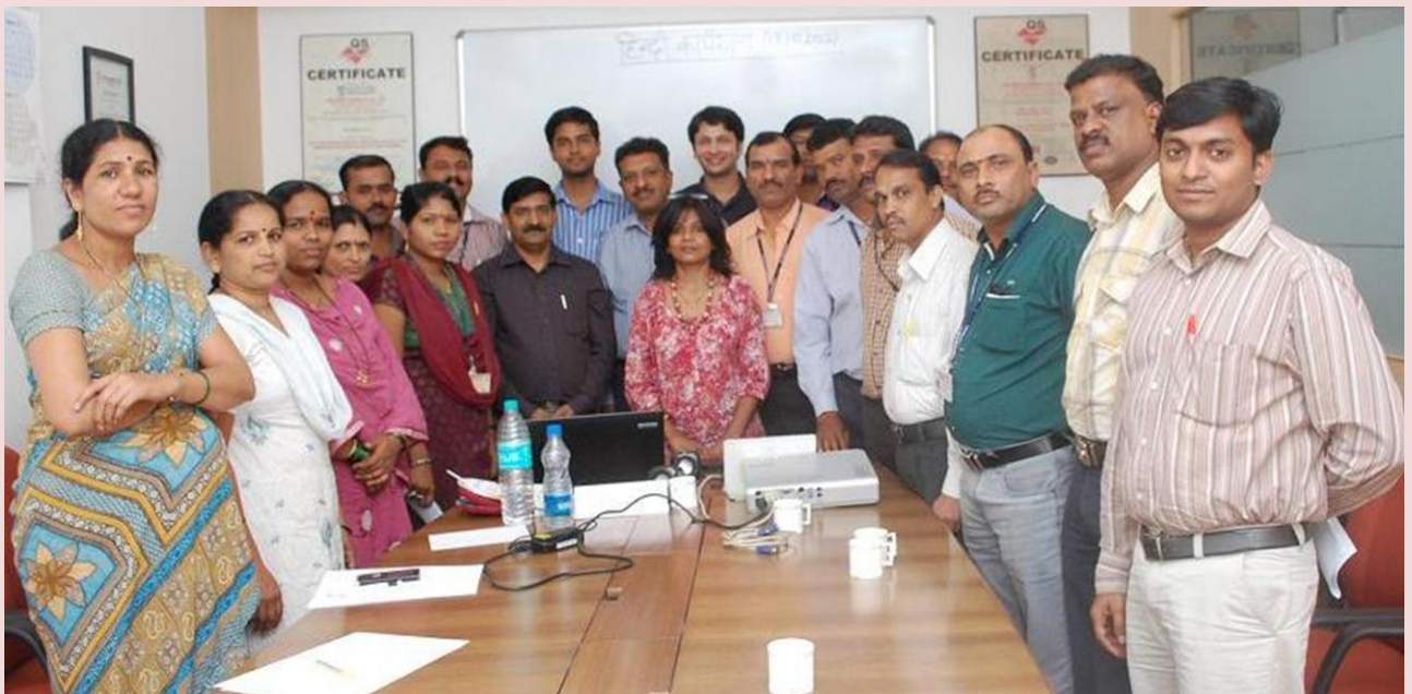
दिनांक 13 अक्टूबर 2012 को सी एफ एस में अधिकारियों एवं कर्मचारियों के लिए हिन्दी कार्यशाला आयोजित की गयी थी, जिसमें कुल 19 अधिकारियों एवं कर्मचारियों ने हिस्सा लिया था। कार्यशाला में भारत सरकार के नियम, अधिनियम, धारा 3(3) एवं दायित्व तथा वार्षिक लक्ष्य से परिचित कराया गया।