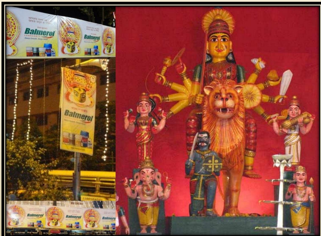
Balmer Lawrie sponsored Bosepukur Talbagan Durga Puja held at Kolkata