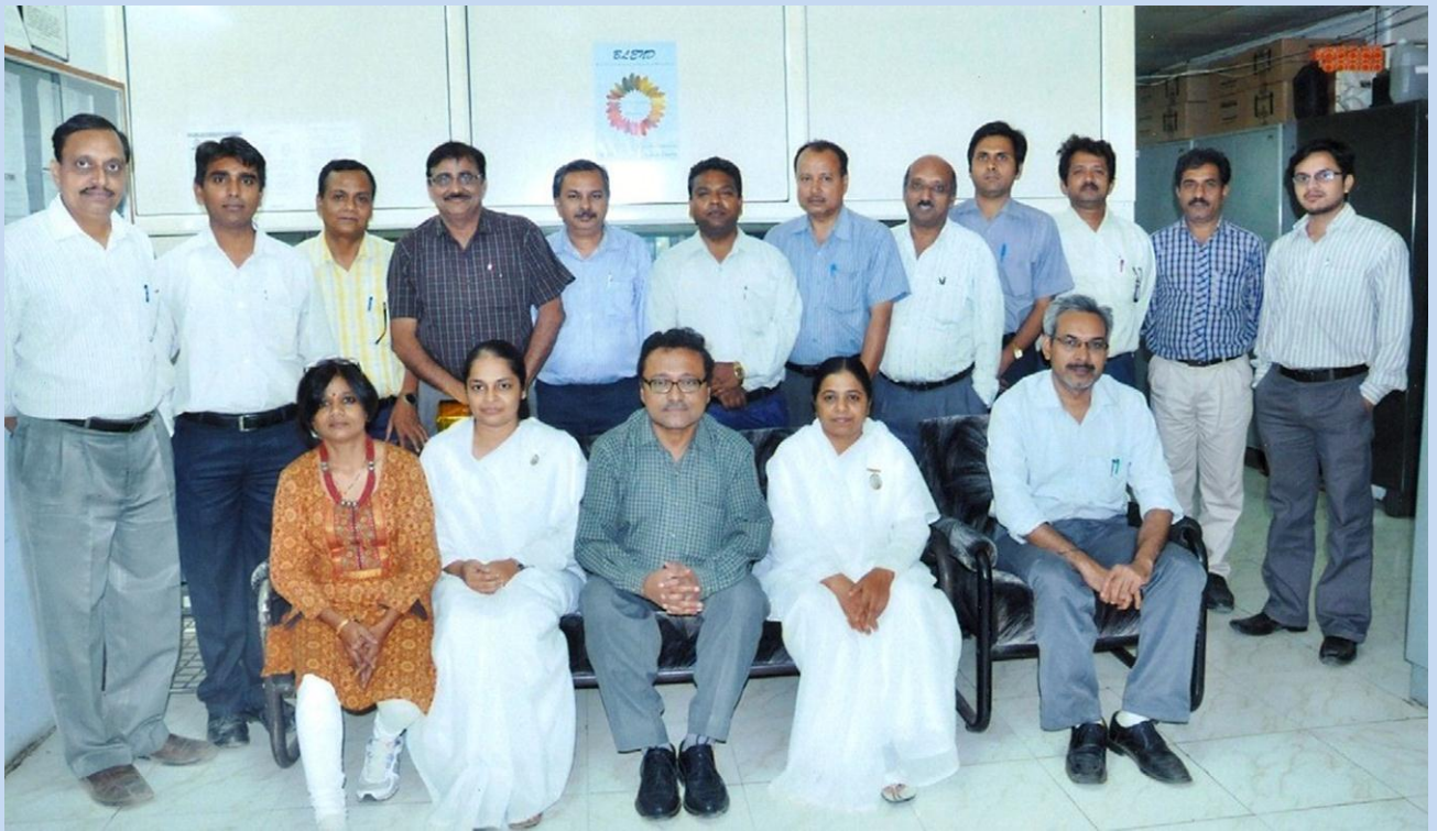
A training program on Ethics in Profession was organized on 19 th October for employees of G&L and IP, Silvassa. The participants are seen in photo along with the trainers.