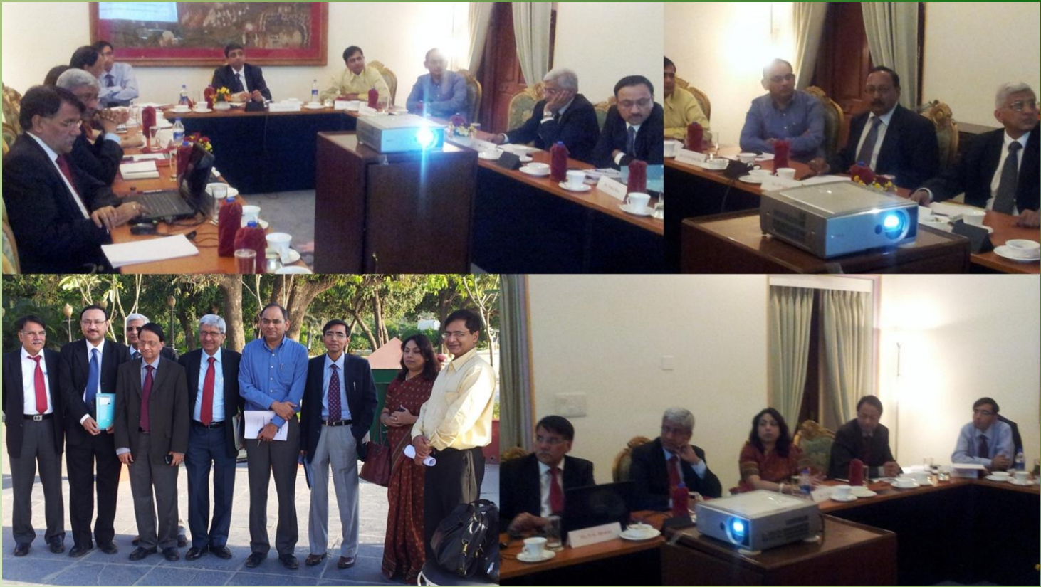
The Strategy Meet was held on 16 th and 17 th November 2012 at Udaipur. In photo are glimpses of the Meet.