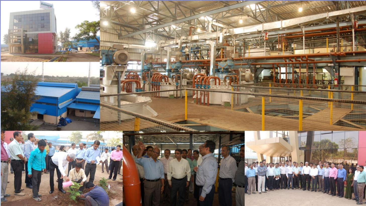
In photo above are glimpses of the inauguration function and snapshots of the new Greases & Lubricants Plant at Silvassa.