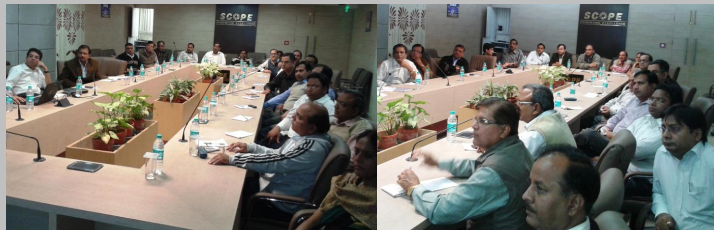
An ERP Awareness programme was held in Delhi for Northern Region employees on 21st & 22nd November. Currently BLESS is in the realization stage and Conference room Pilots are being held for the ERP core committee.