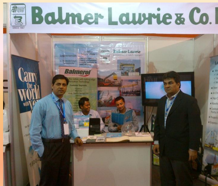
SBU: LS, LI, T&T, G&L and PC participated in Natcom 2012, held on 23 & 24th November, 2012 at Science City, Kolkata. The conference organised by Indian Institute of Materials Management, was based on the theme 'Building & Sustaining Supply Chain: Emerging Concepts, Technology & Process'.