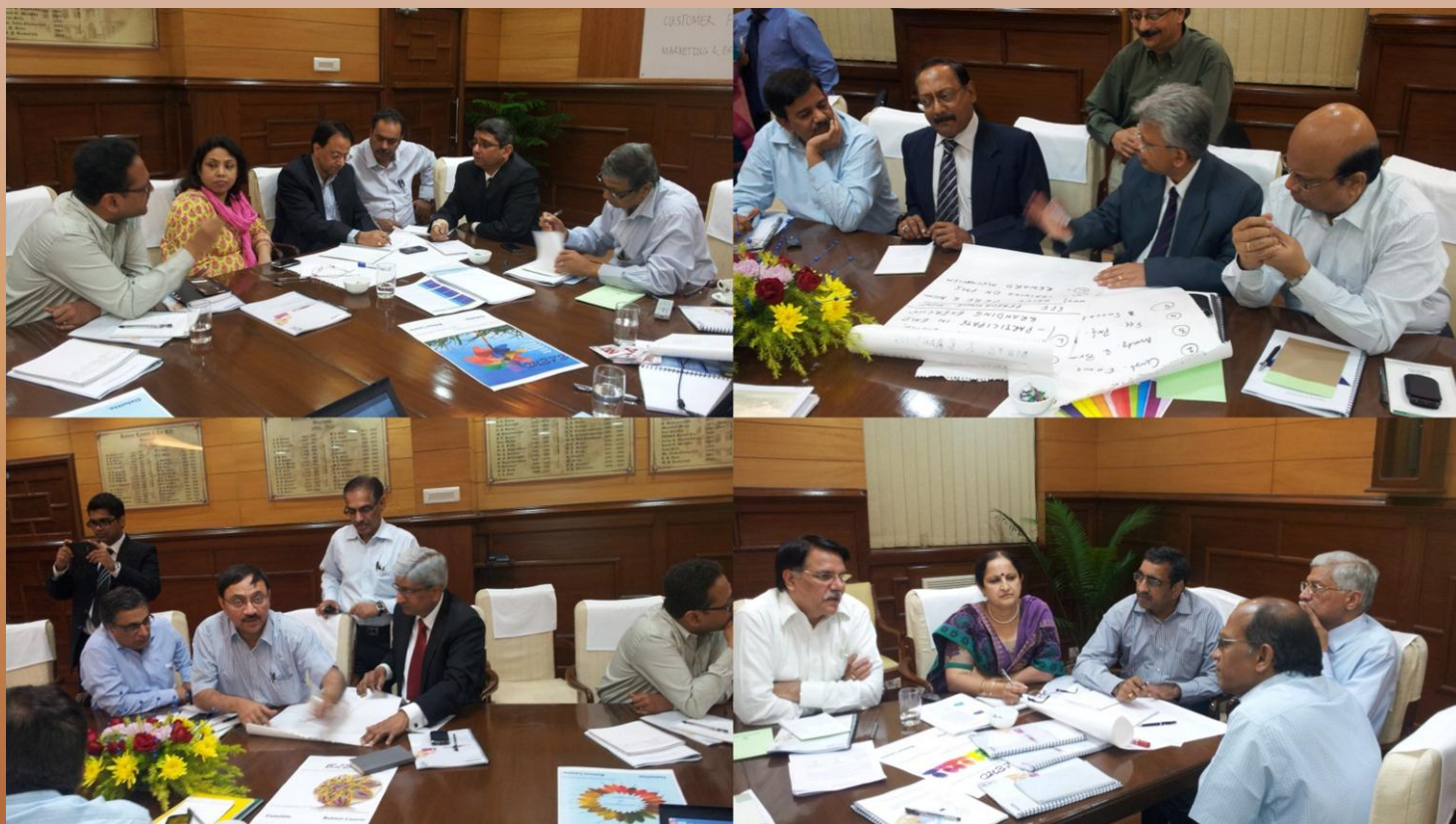
In the Top Management Meet held at Kolkata on 29 th November, the Deloitte Team made a detailed presentation on the findings of the Employee Engagement Survey. The Top Management worked in groups to identify key issues which need to be addressed to enhance Employee Satisfaction and Engagement in BL. The Top Management is seen brainstorming on key employee satisfaction issues in the photographs.