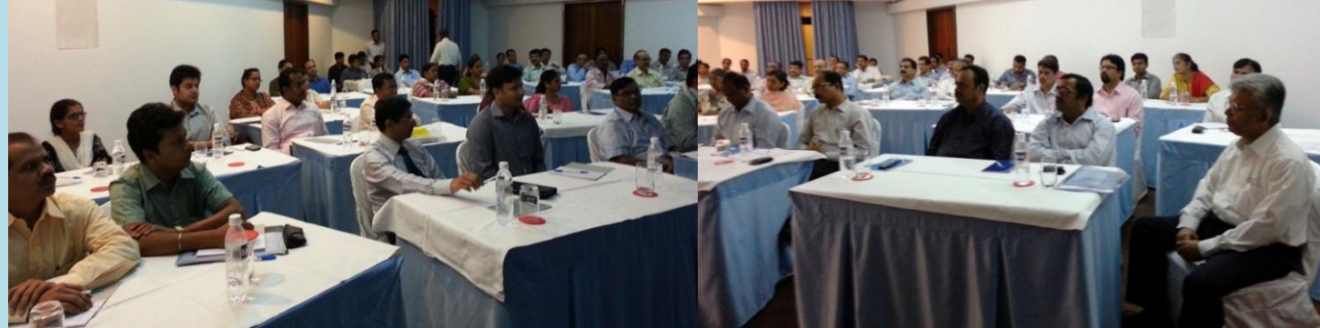
An ERP Awareness Program was organised for employees at Mumbai on 7th November, 2012.