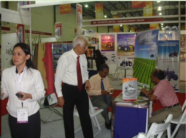
SBU: G&L and PC of Balmer Lawrie and PT Balmer Lawrie Indonesia participated in the "India Show 2012", organised by CII and supported by the Ministry of Commerce & Industry, Department of Commerce, GOI & Embassy of India, at Jakarta, Indonesia from 6th to 8th March 2012.