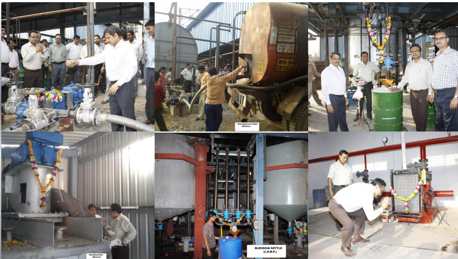
The first phase of western region grease manufacturing project at Silvassa was successfully completed by 31 st March, 2012. The Bituminous Compound plant and Lube Oil plant with augmented capacity and fire hydrant system were commissioned during the last week of March. The E&P team worked in close co-ordination with G&L team to make it happen. Kudos to both the teams!