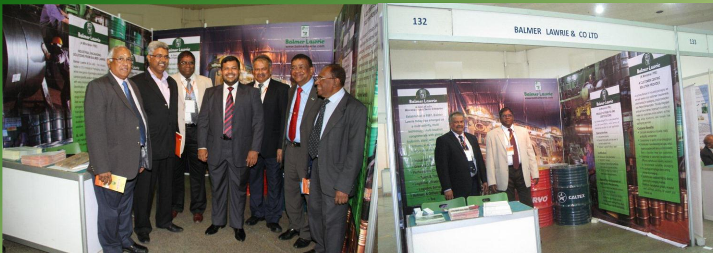
SBU:IP participated in the Lankapack 2012, the biggest International Packing Exhibition held in Sri Lanka from 25th to 27th May 2012. The Sri Lankan Minister for Commerce and Industry, officials from the Indian High Commission and other dignitaries visited the Balmer Lawrie stall.