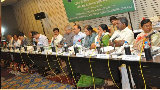
The Standing Committee on Petroleum and Natural Gas visited Chennai on 3rd & 4th February as part of a study tour. During the visit, our C&MD and Directors had a meeting with the Committee.