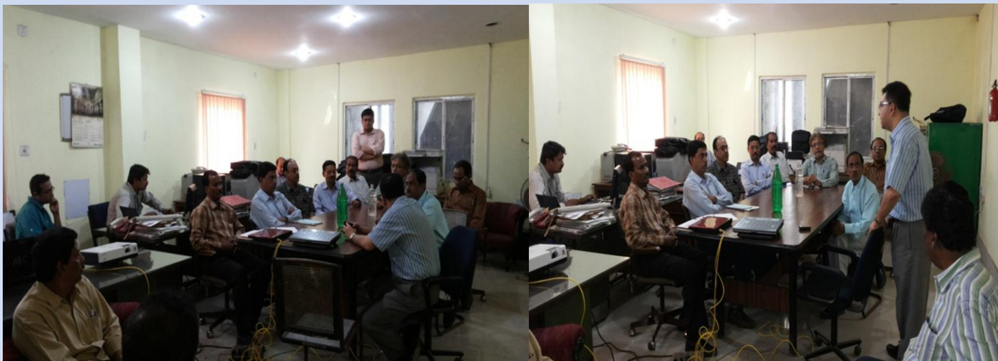
Training on the MM Module was held on 26 th & 27 th Feb in CCDC for SBU:IP.