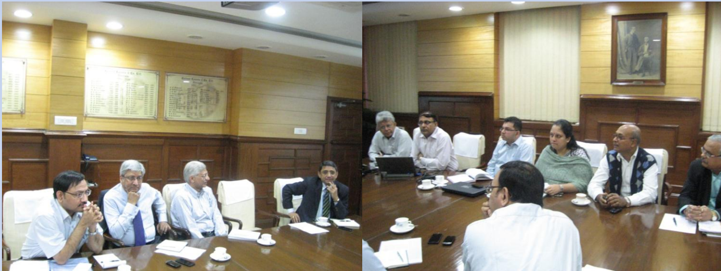
The Steering committee meeting was held in Corporate Office, Kolkata on 19 th Feb 2013. All Directors, the Project Management team of BL, TCS and PwC were present.

Phase 1 of the BLESS project is now in the Go-live readiness stage. End User Training has commenced.