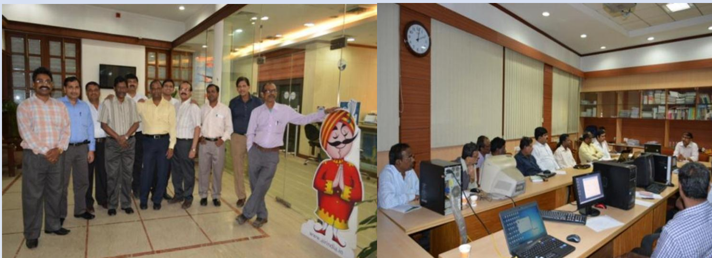
On 23 rd & 24 th Feb training on the Sales & Distribution module was organized in Corporate Office, Kolkata. While the FI training was held on 26 th & 27 th Feb, the HCM training took place on 27 th & 28 th Feb.