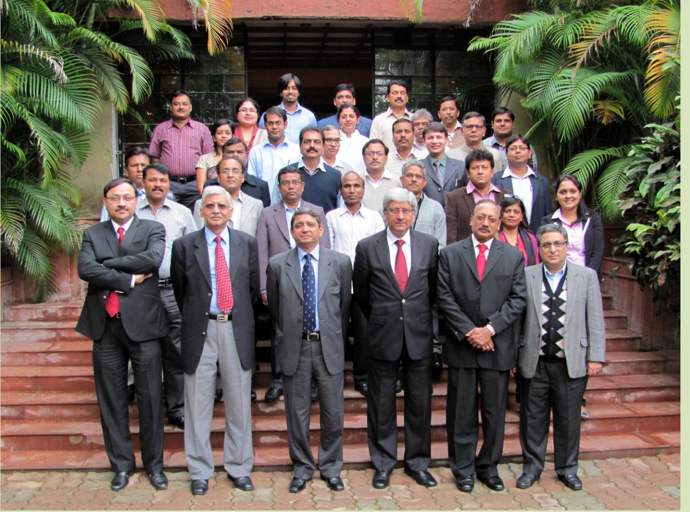
The HR Meet was held on 18 th & 19 th January at Chalsa. In photo, Team HR poses with C&MD and Directors.