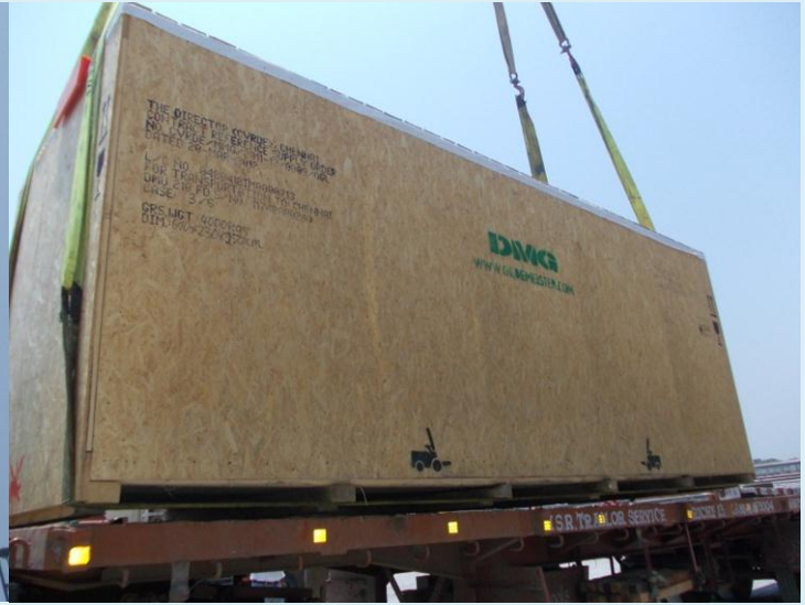
LS, Chennai successfully handled high volume break-bulk shipment (single parcel of 48 MT) for C.V.R.D.E., Avadi, Chennai. The scope of work included movement of cargo from the port of origin, customs clearance, and loading & delivery to the site.