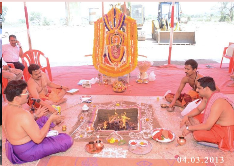
A bhoomi puja was organised on 4th March, 2013 at the High Throughput Plant (HTP), project site at Taloja.