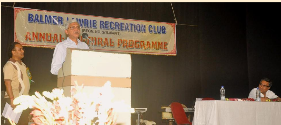
The Annual Cultural Function of BLRC was organised on 10th of March, 2013 at Mahajati Sadan, Kolkata. Present on the occasion were D[S] and SVP[HR].