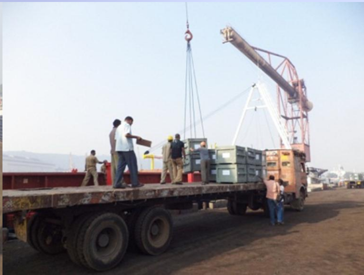
In the first week of March 2013, LS, Vizag handled Breakbulk Ocean Import Charter for Mazagon Dock Limited, Mumbai comprising of Defense equipment. The project involved Stevedoring, Customs Clearance, and Transportation & Delivery of the material from Russia to the Indian Navy Unit located in Vizag.