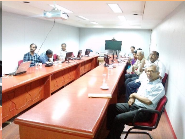
IT Dept. organized E-Procurement Training Sessions for Vendors and Buyers in Chennai on 7 th & 8 th March, 2013. The sessions were attended by users from SBUs: PC, LI, LS, G&L and IP and Vendors of the Manufacturing SBUs.