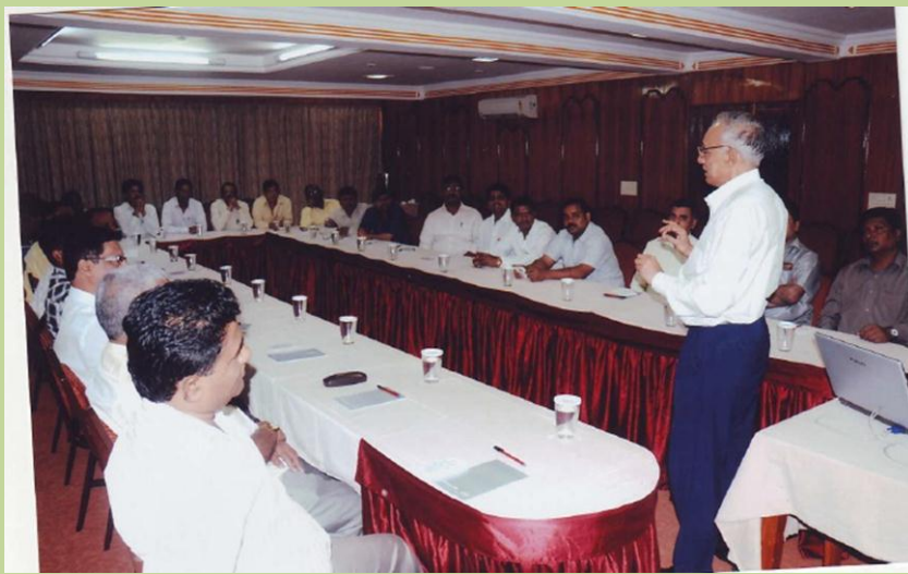
A training program on Quality Circle was organized for officers of IP, Sewree by Quality Circle of India Mumbai Chapter, in March 2013.